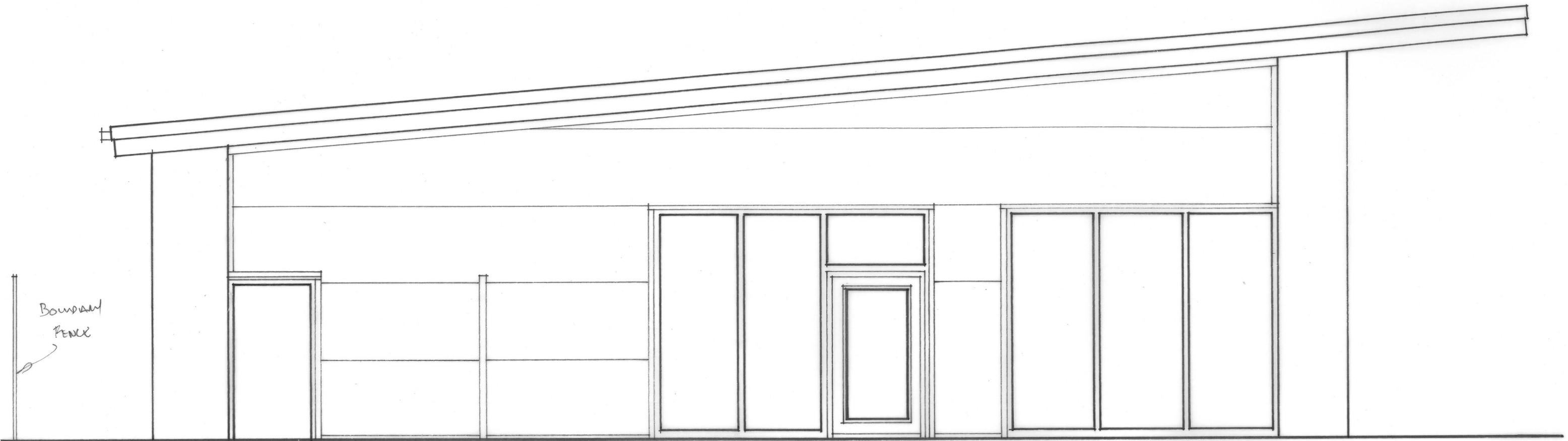
EXISTING GABLE ELEVATION 1:50