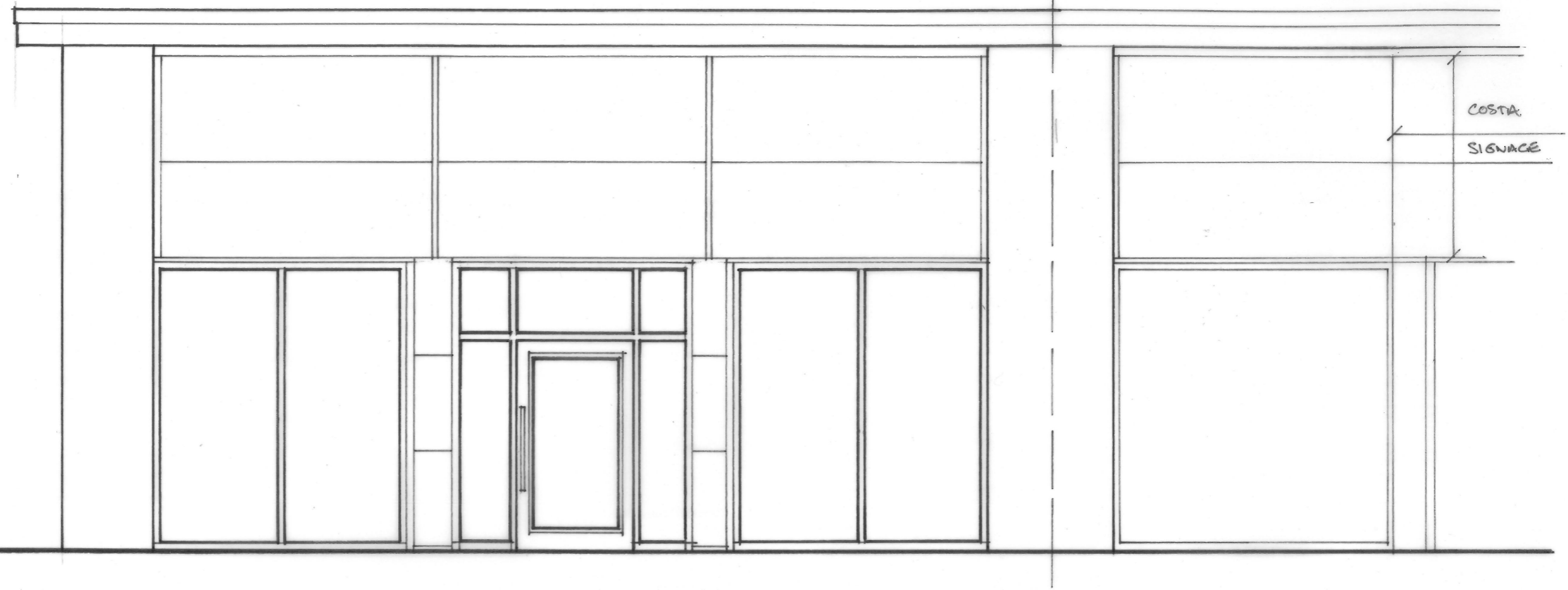
EXISTING FRONT ELEVATION 1:5