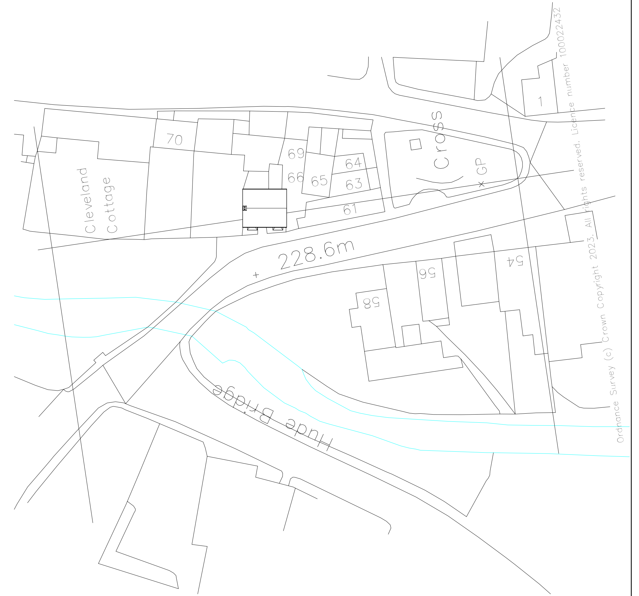
5 Site 1 : 500