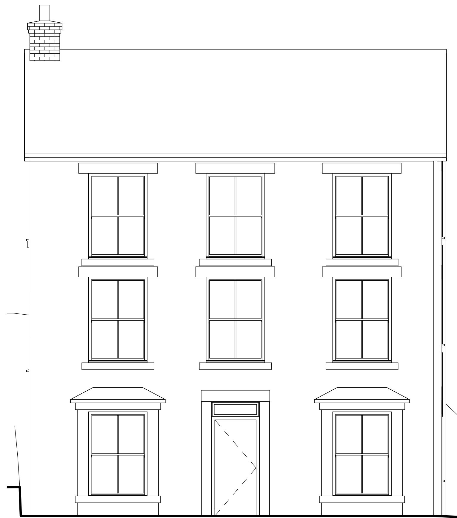
3 West Elevation 1 : 50