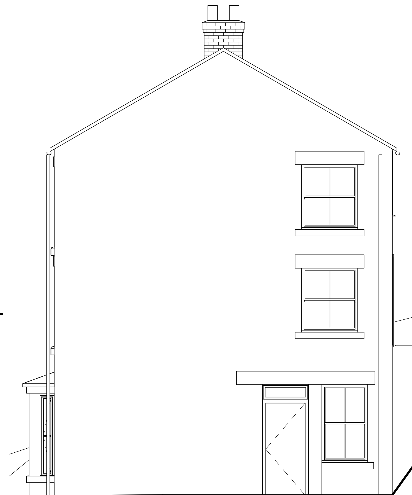
1 South Elevation 1 : 50

DO NOT SCALE from this drawing. only figured dimensions are to be taken from this drawing.