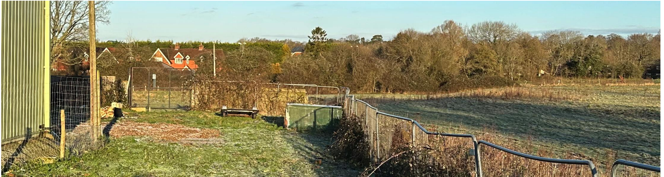
Existing site with fence and gate