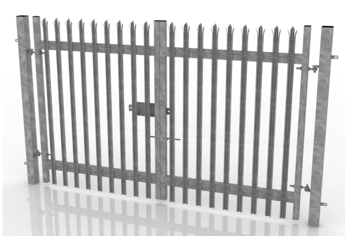
Proposed gate precedent