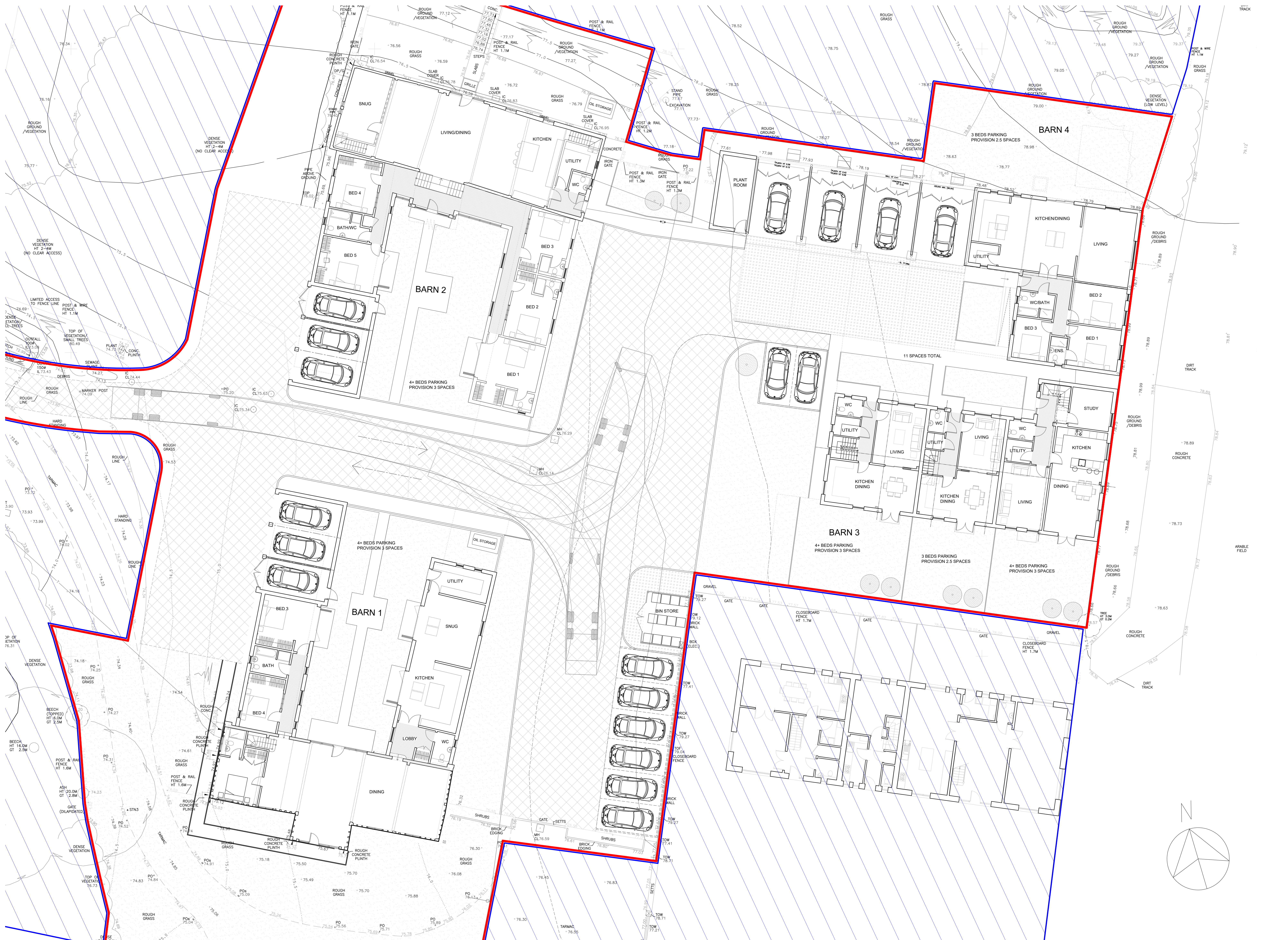
Ground Floor Layouts & Site Plan 1:100