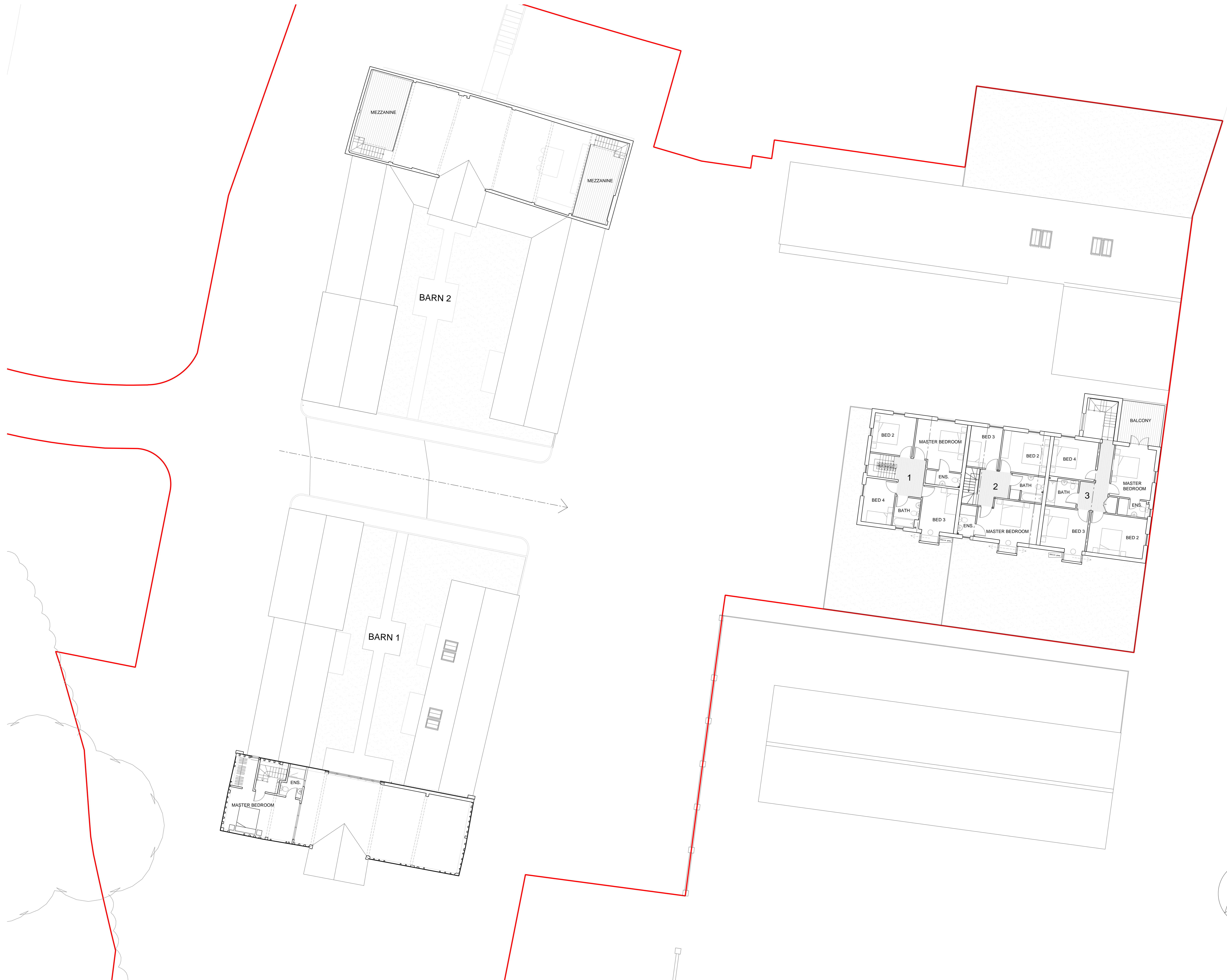
First Floor Layouts & Site Plan 1:100