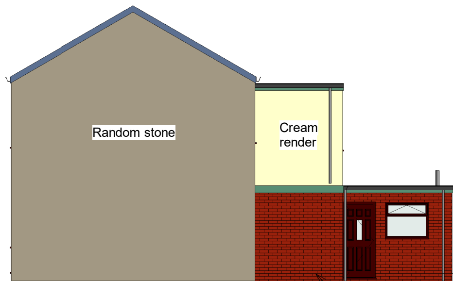
1 NE elevation 1 : 100