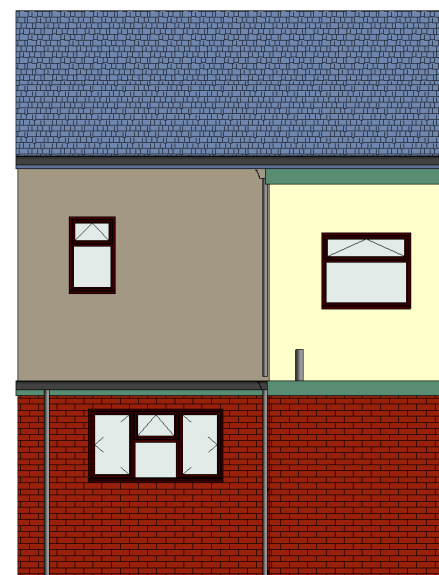
3 NW elevation 1 : 100