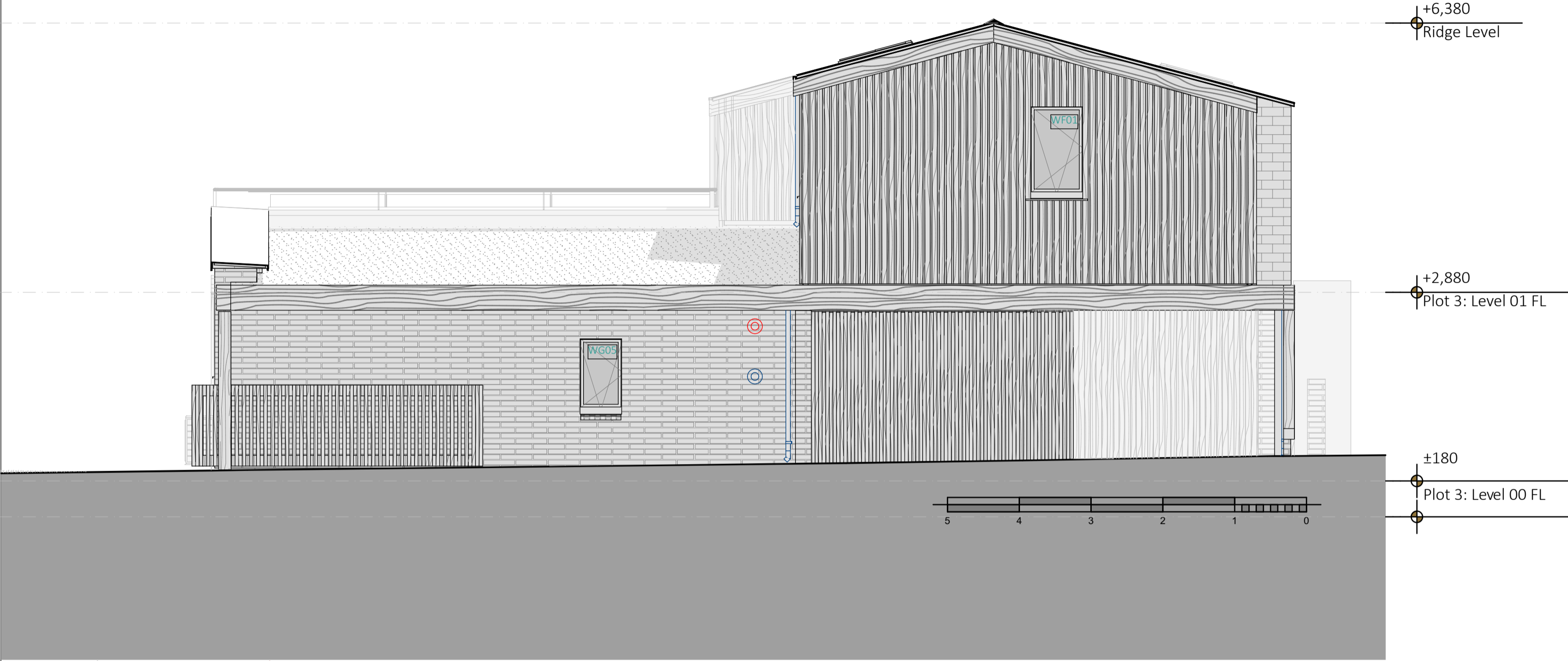
Plot 3 | GA North Elevation | 1:50