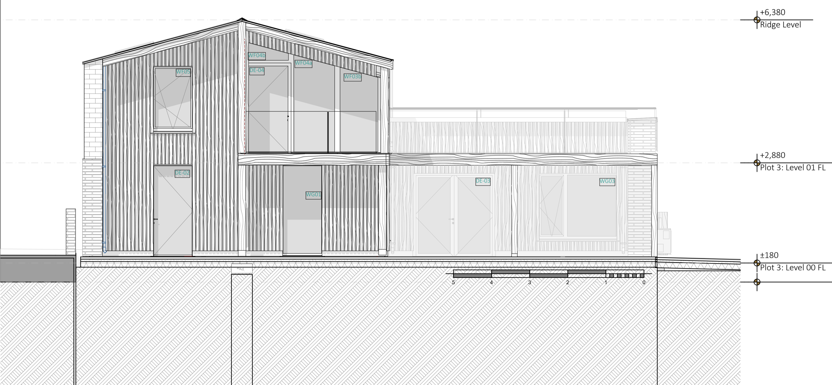
Plot 3 | GA South Elevation | 1:50