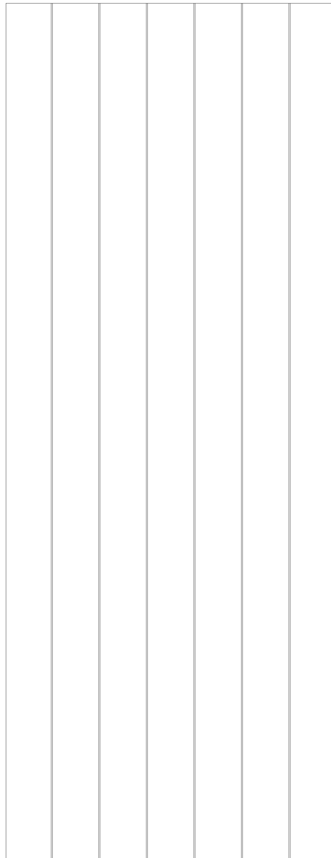
Detail Front Side Interior Door 1:5