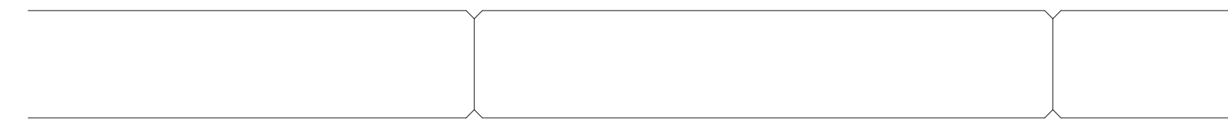
Detail Board Groove Detail Interior Door 1:1