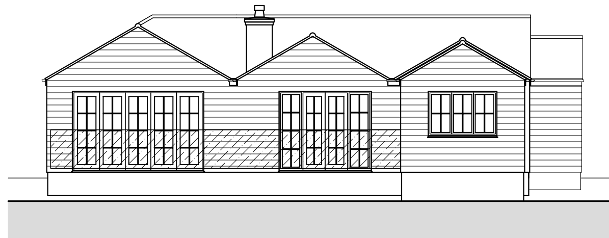
Rear Elevation (North)