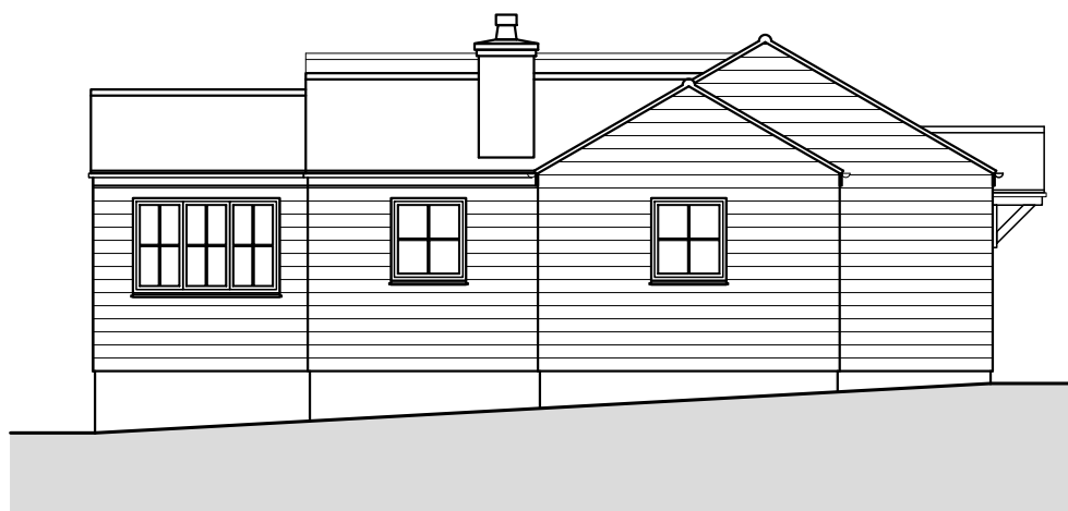
Side Elevation (West)