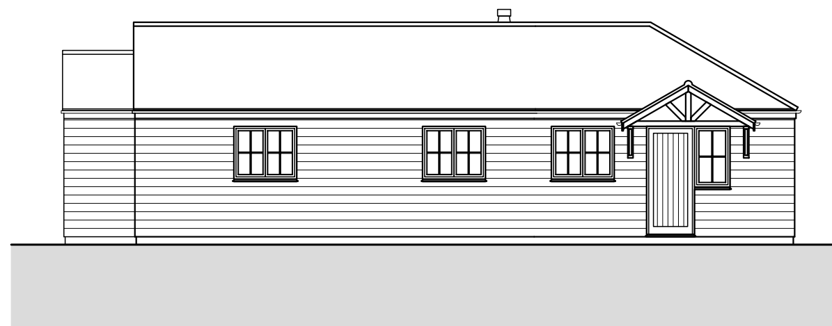
Front Elevation (South)