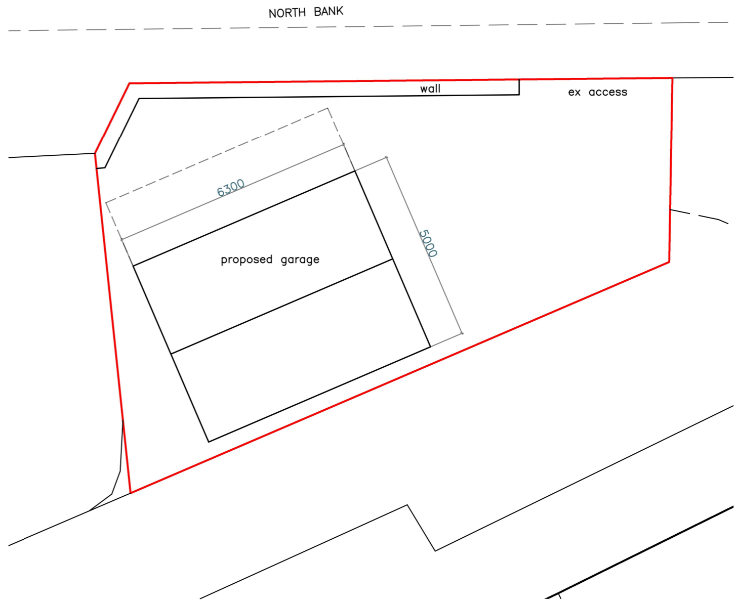
enlarged site block plan 1:100

SITE AREA: 114sqm GRID REF: NY 83905 64666 What3Words: indicates.thus.measuring