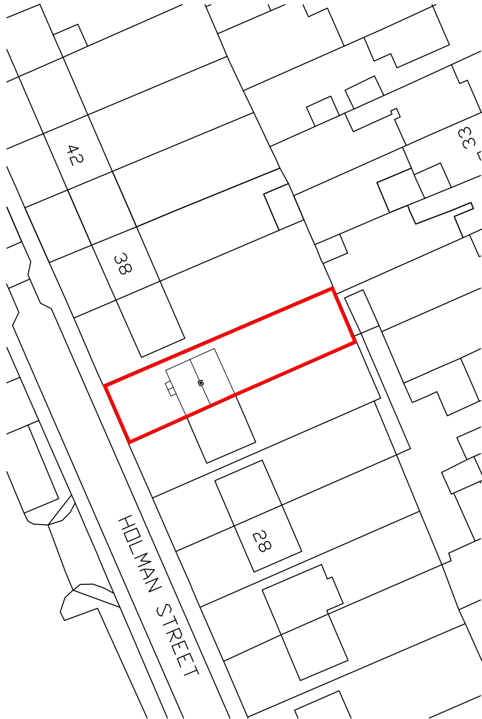
Existing Block Plan 1:500