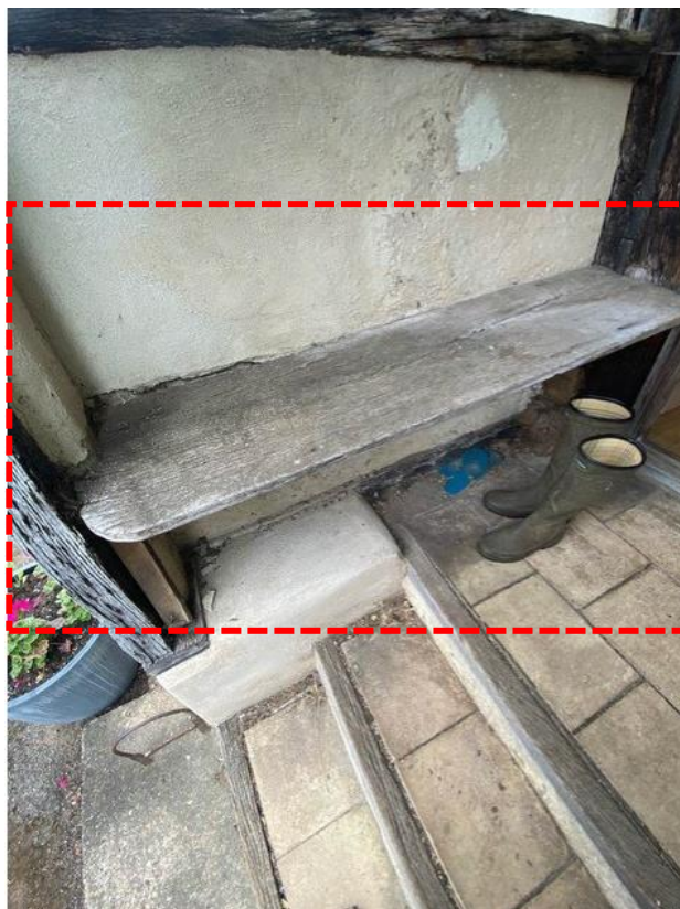
Above: Extent of left-hand timber bench for replacement