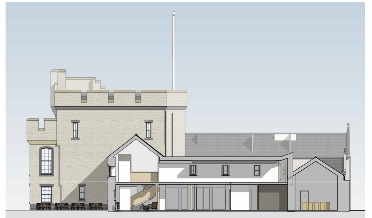
4. PROPOSED EAST WING SECTION SCALE 1 : 200