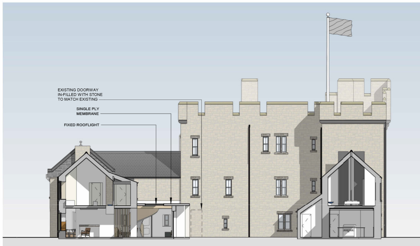
3. PROPOSE COURTYARD CROSS SECTION SCALE 1 : 200