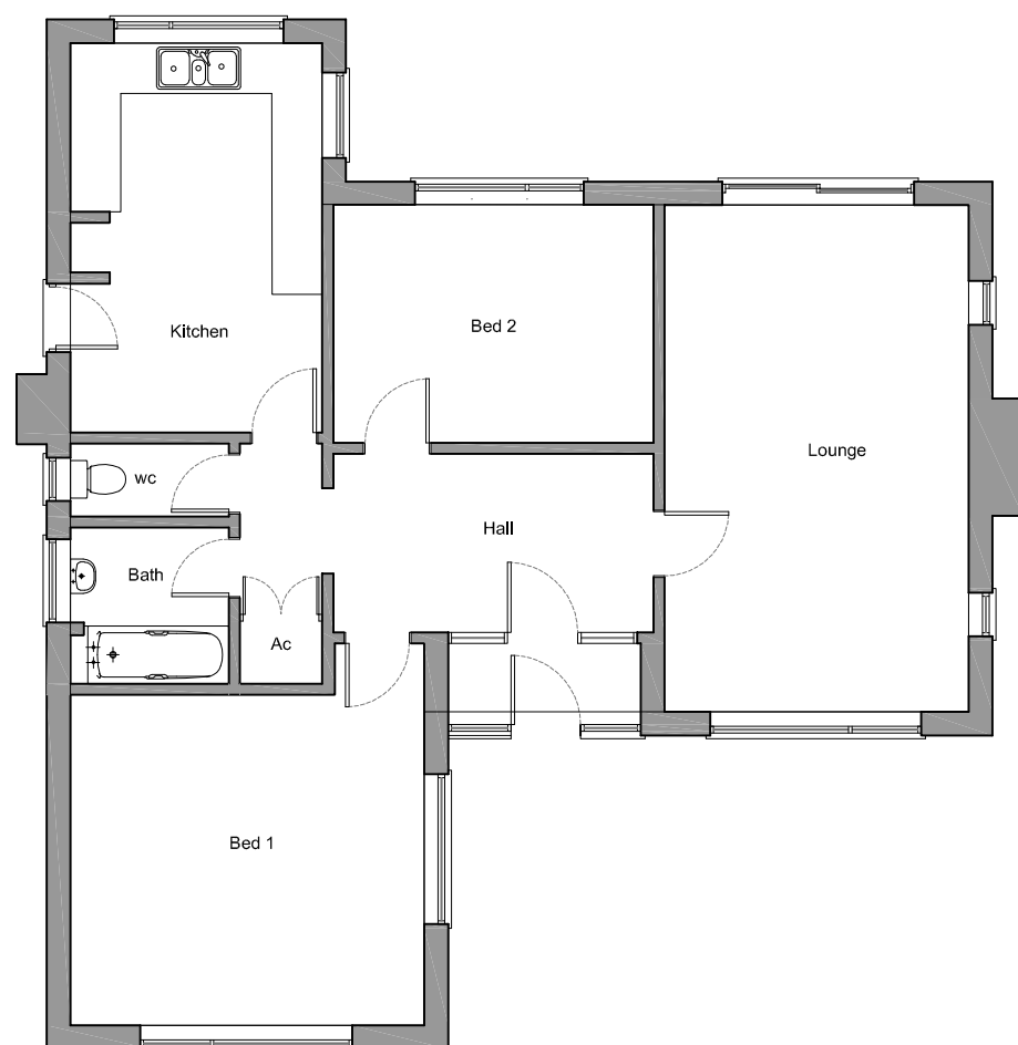
Ground Floor Plan 1:100