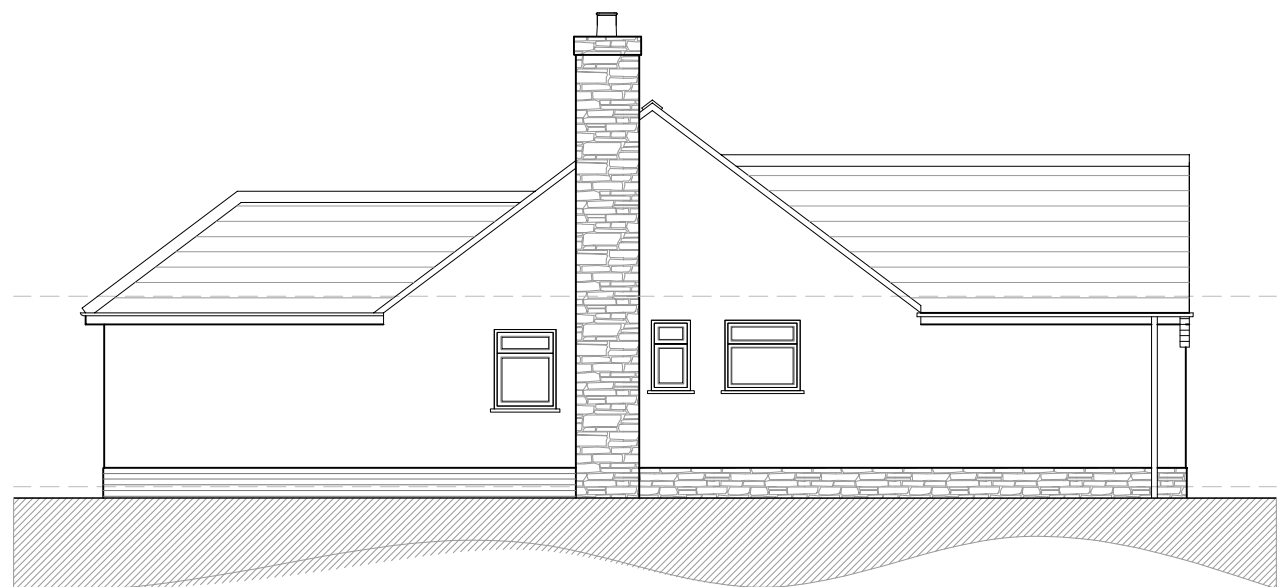
Side (North West) Elevation