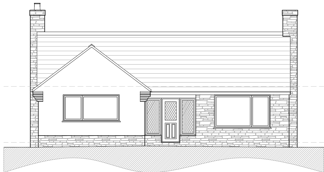
Front (South West) Elevation