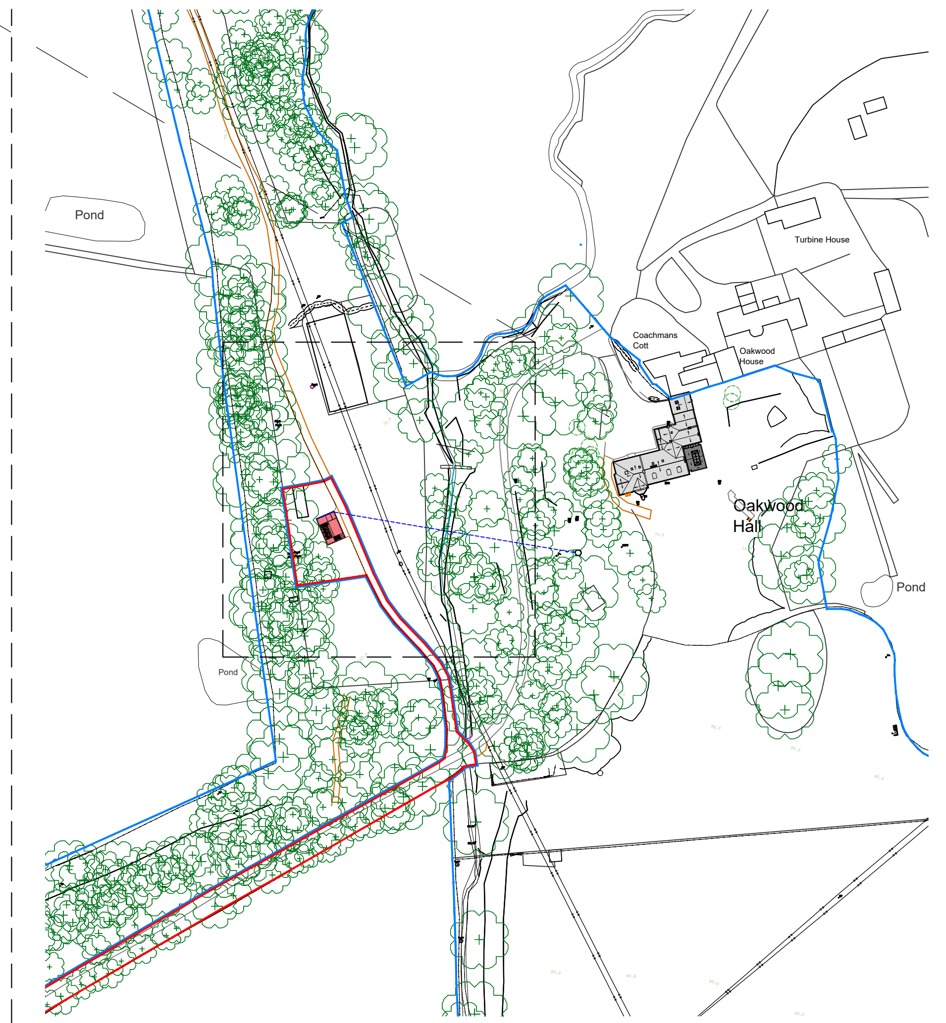
Proposed Site Plan - Overall Site (1:1250)