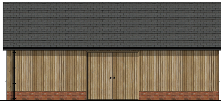
Proposed East Elevation (Front)