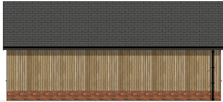
Proposed West Elevation (Rear)

Do not scale the drawing. Use figured dimensions in all cases. Check all dimensions on site. Report any discrepancies to BH Architecture before proceeding.