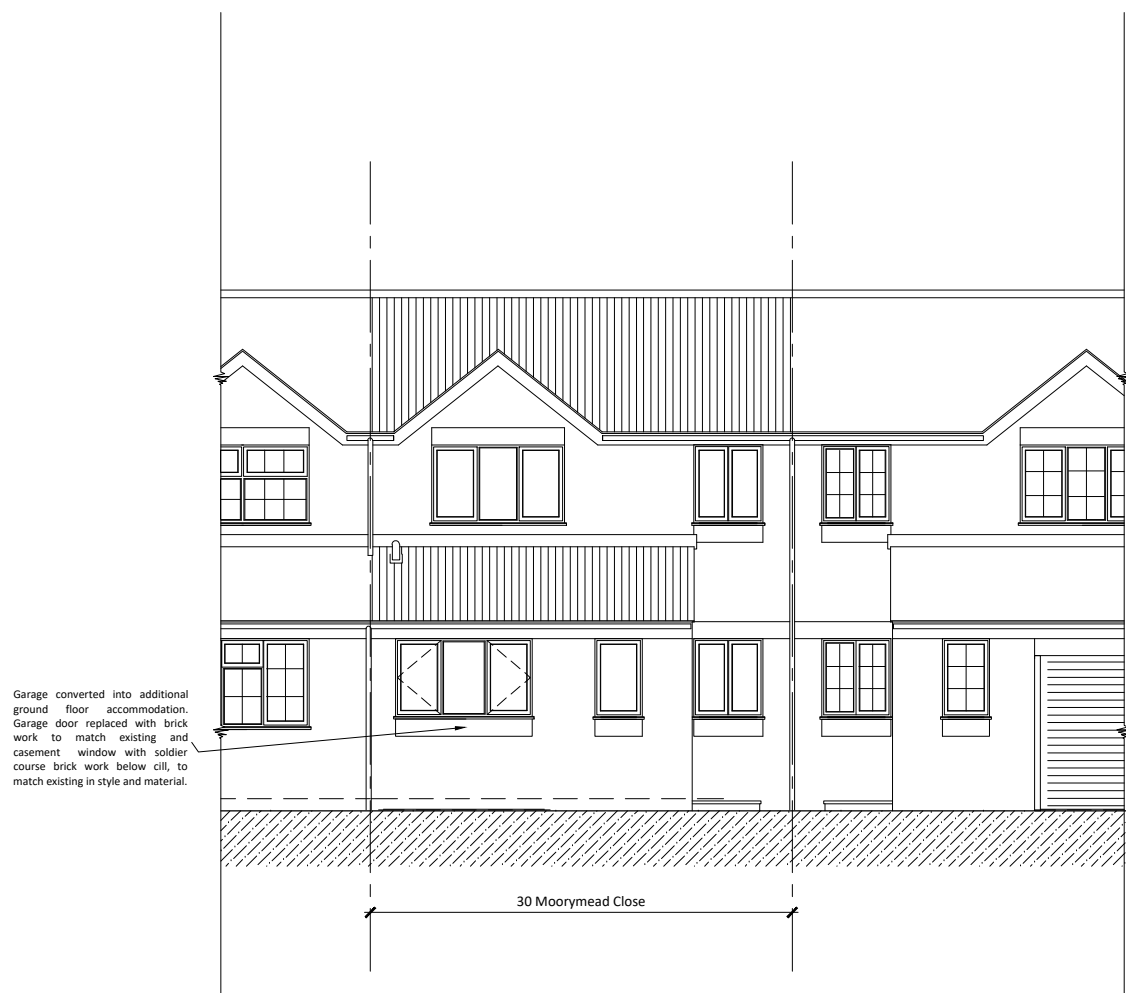
FRONT ELEVATION - OPTION 1 AS PROPOSED - FACING SOUTH-WEST