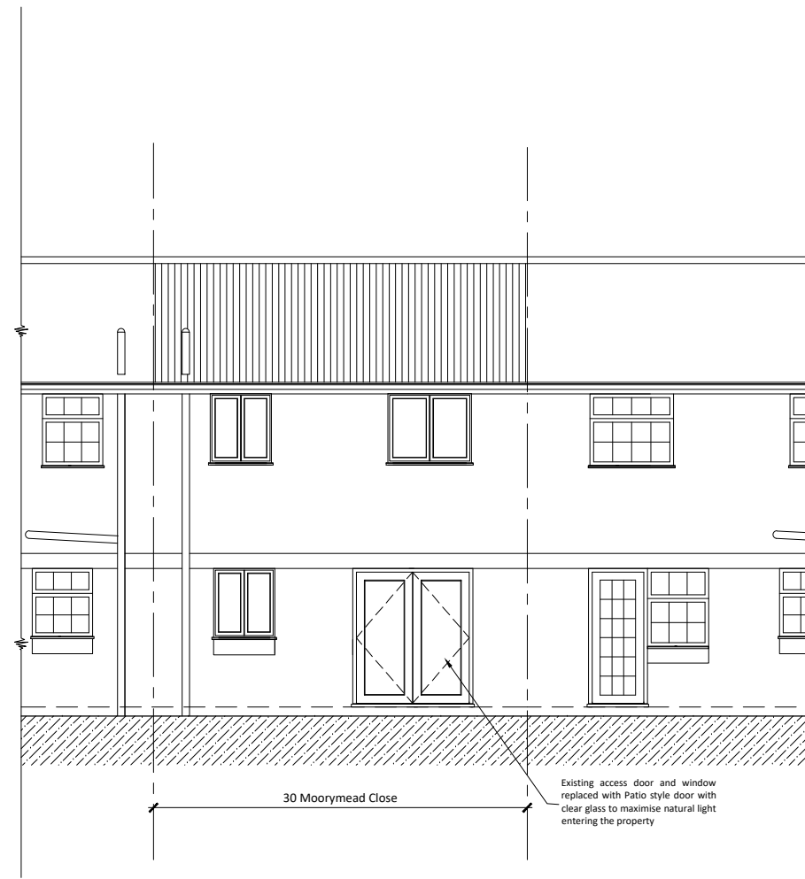
REAR ELEVATION - OPTION 1 AS PROPOSED - FACING NORTH-EAST