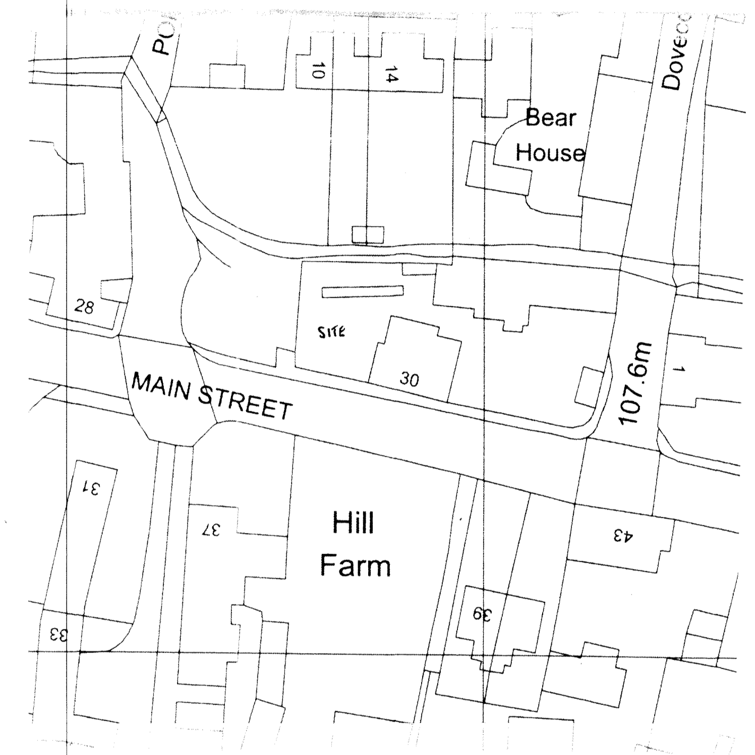
Block Plan - 1/500 - NORTH

JONATHON HARTLEY LIMITED THE OLD CURIOSITY SHOP 28 ST PETER'S STREET STAMFORD LINCOLNSHIRE PE9 2PF