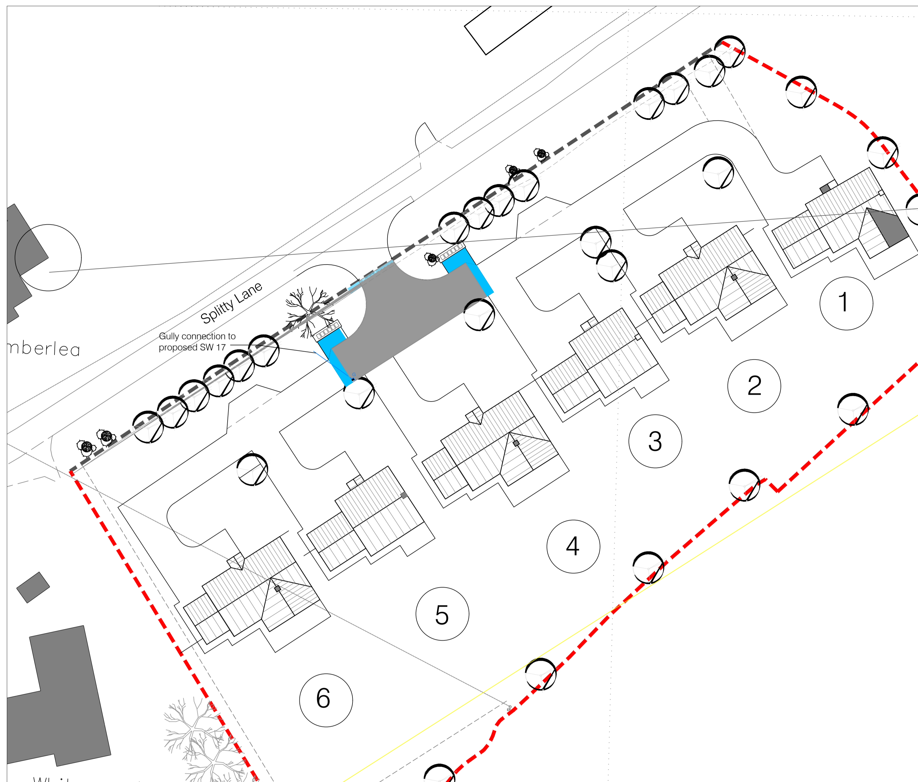
Section 38, Scale 1:200