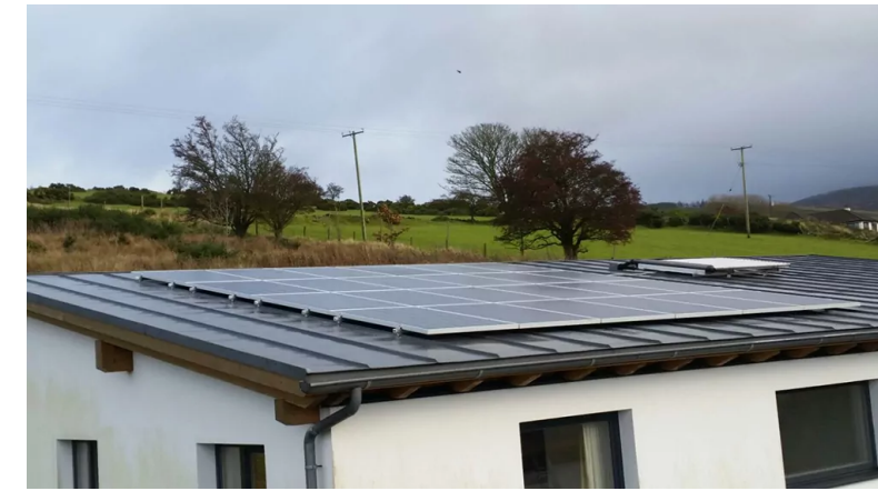
Proposed low profile PV panels

NOTE: All windows and doors (except on principal elevation) to be replaced with heritage style flush casement windows / doors constructed from hardwood, painted heritage colour to be confirmed