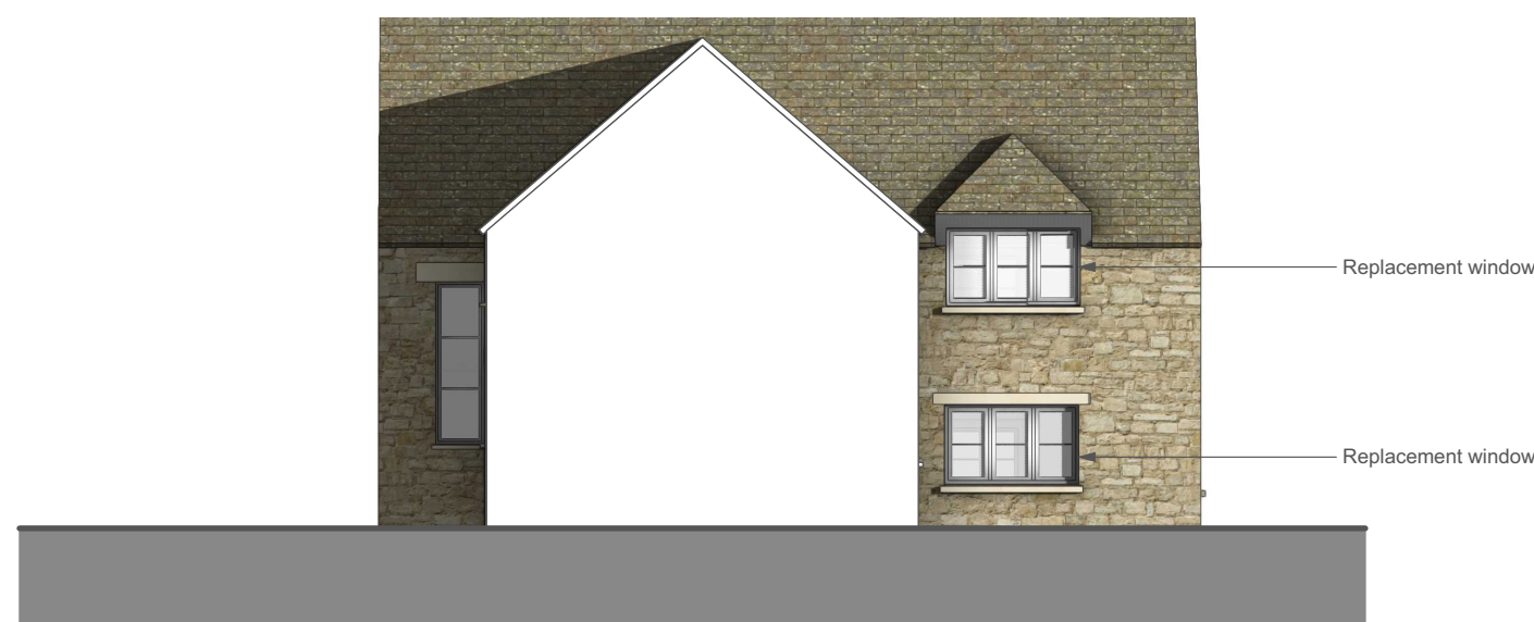
NORTH WEST ELEVATION (without extension)