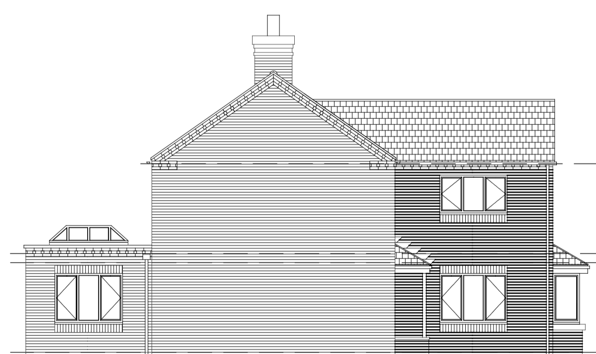
SIDE ELEVATION as proposed