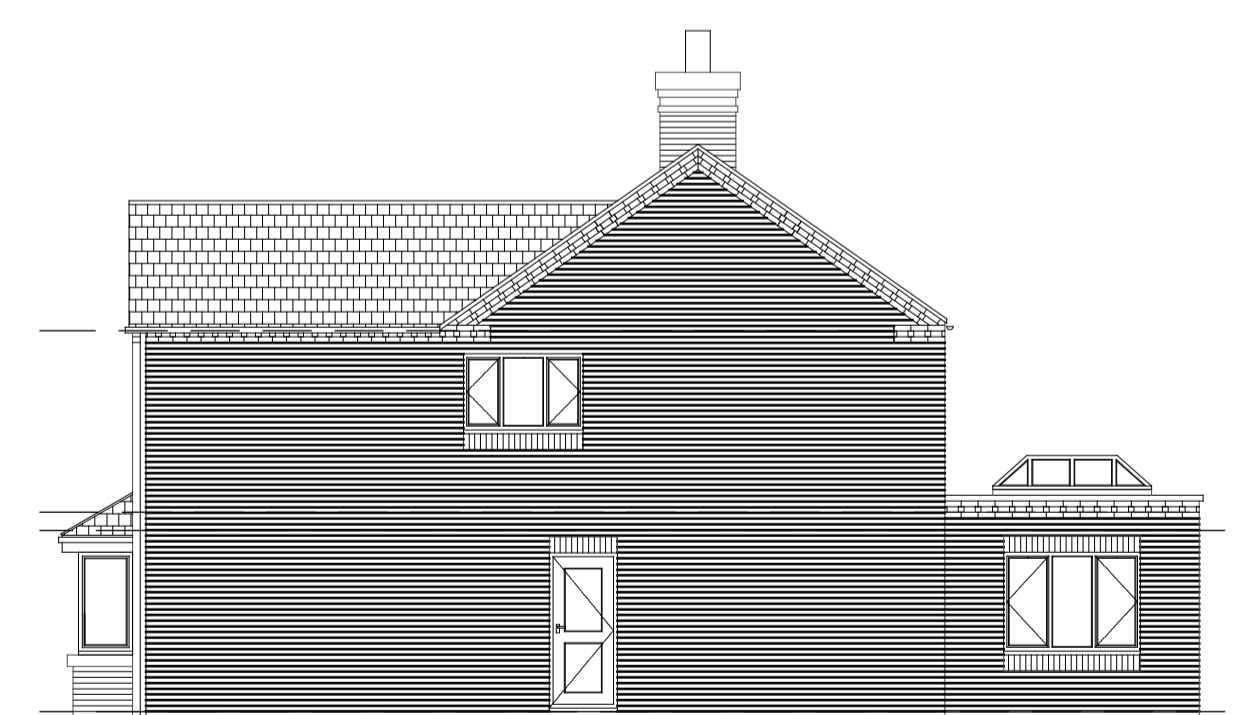
SIDE ELEVATION as proposed