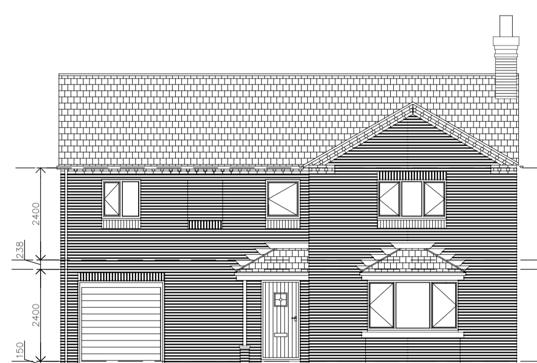
FRONT ELEVATION as proposed