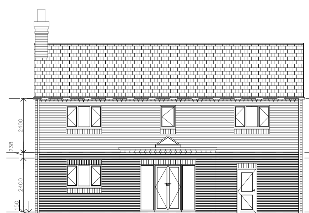
REAR ELEVATION as proposed