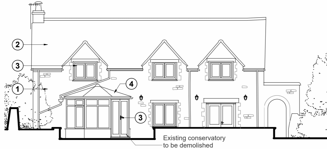
Existing SE Elevation 1 : 100