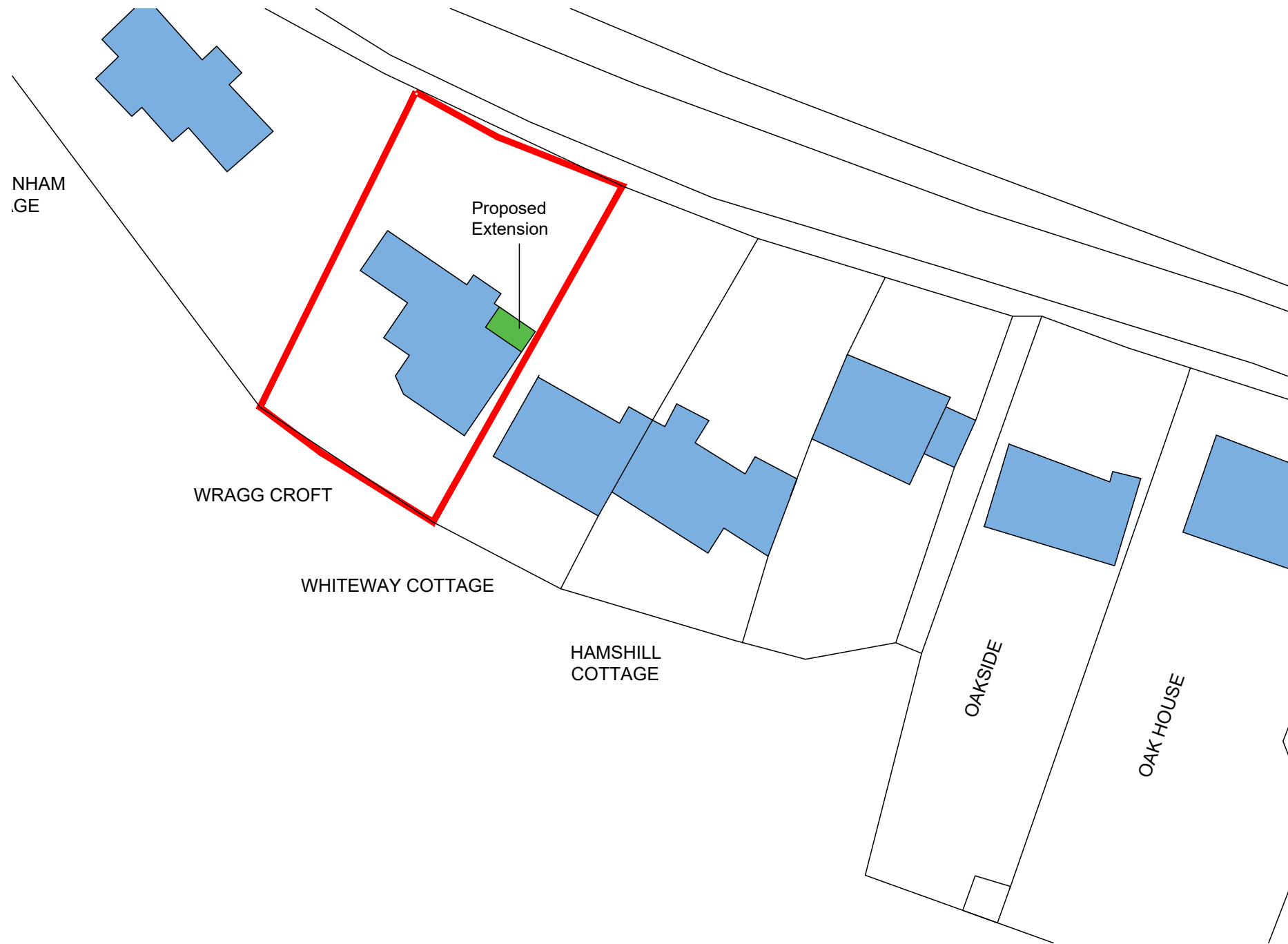
PROPOSED BLOCK PLAN - 1:500