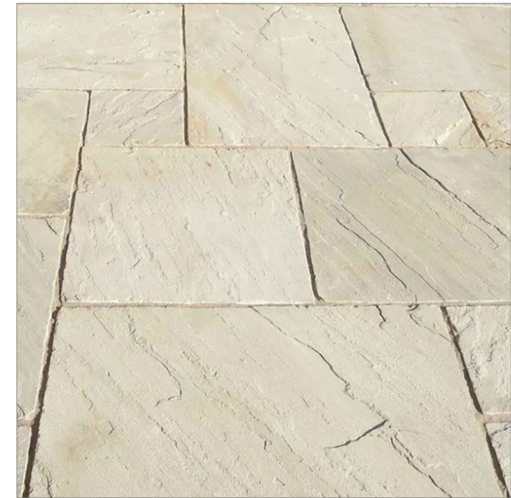
BUFF RIVEN SANDSTONE PAVING SLABS