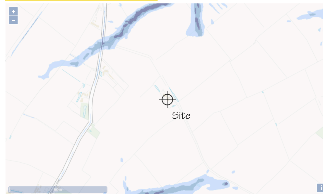
Extent of flooding from surface water

● High ● Medium ● Low ○ Very low ⊕ Location you selected