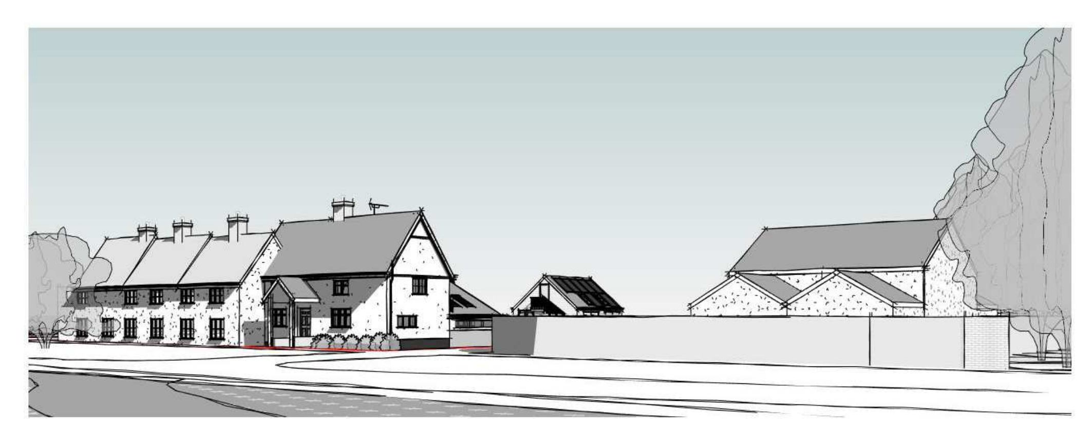
View From Former Parish Coalhouse