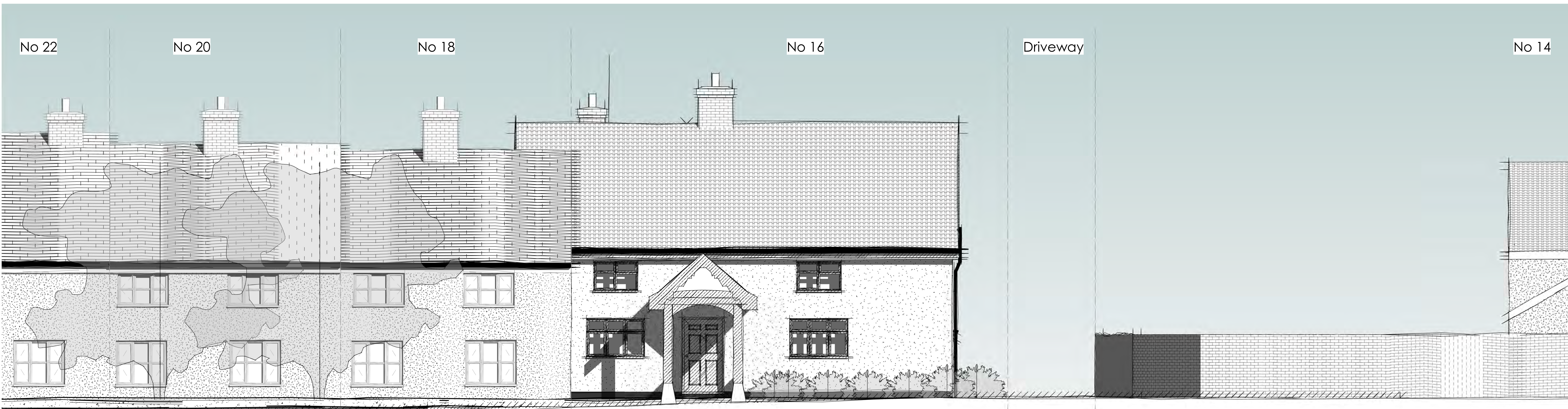
1 Existing Street Scenes 1 : 50