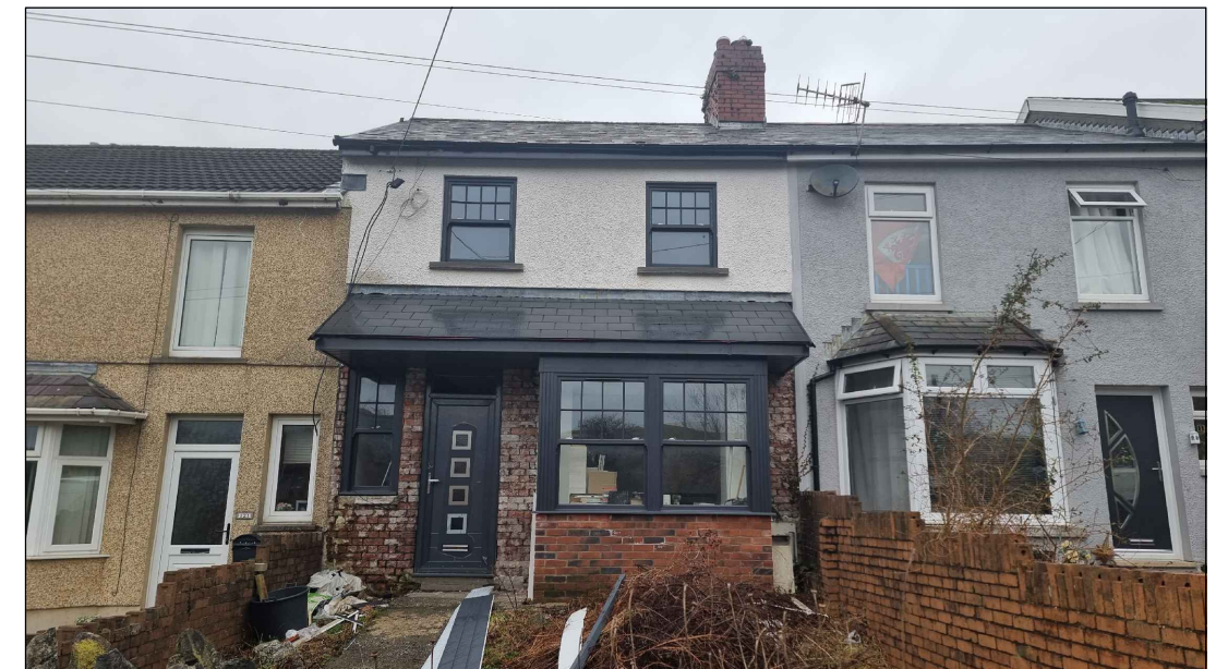
Front Elevation as completed (2023)