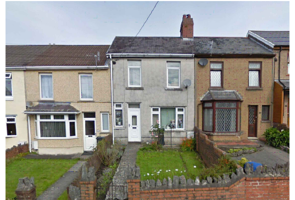
Front Elevation prior to works