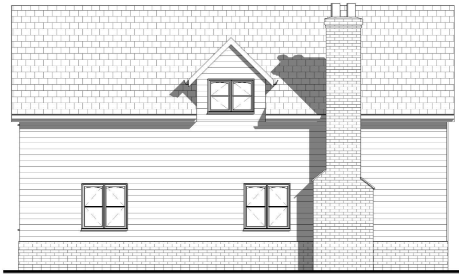
Side B Elevation 1 : 100