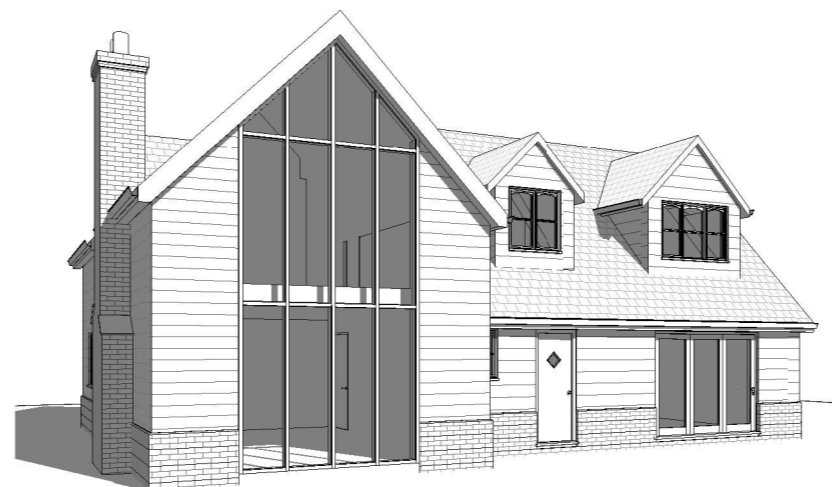
3D View 2