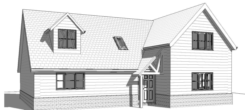
3D View 1