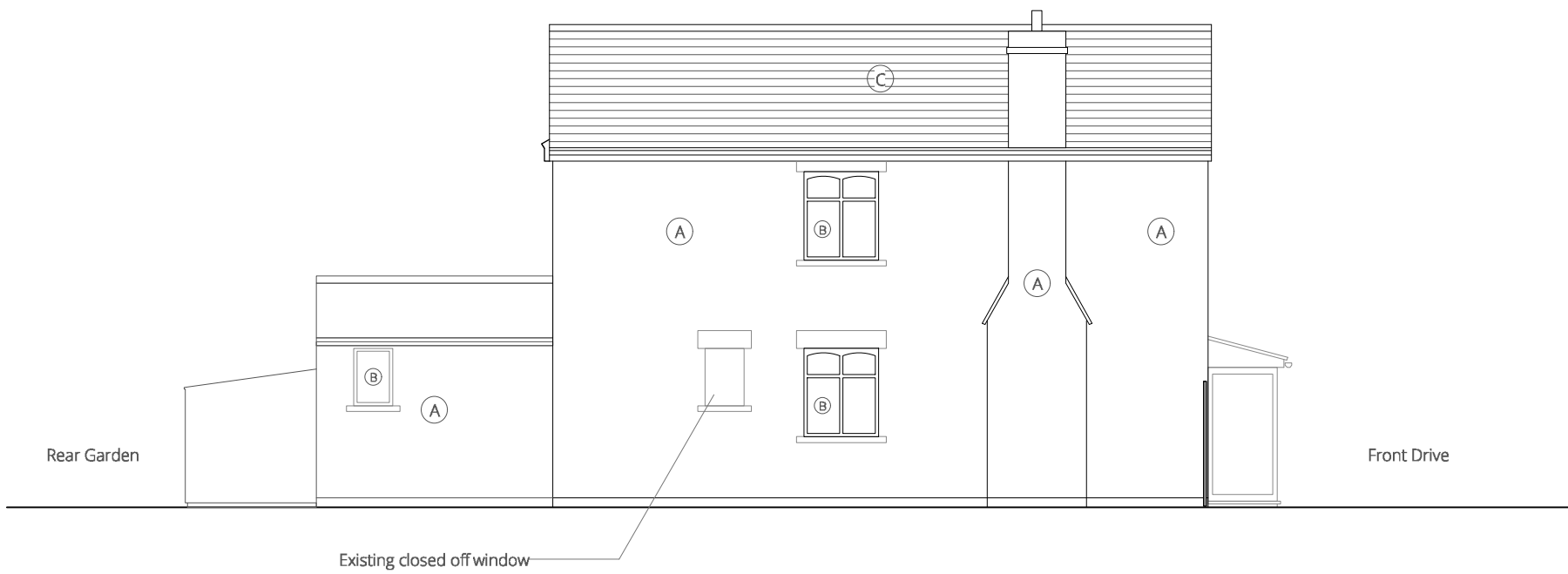
Existing Side (NE) Elevation _ scale 1:100 @ A3