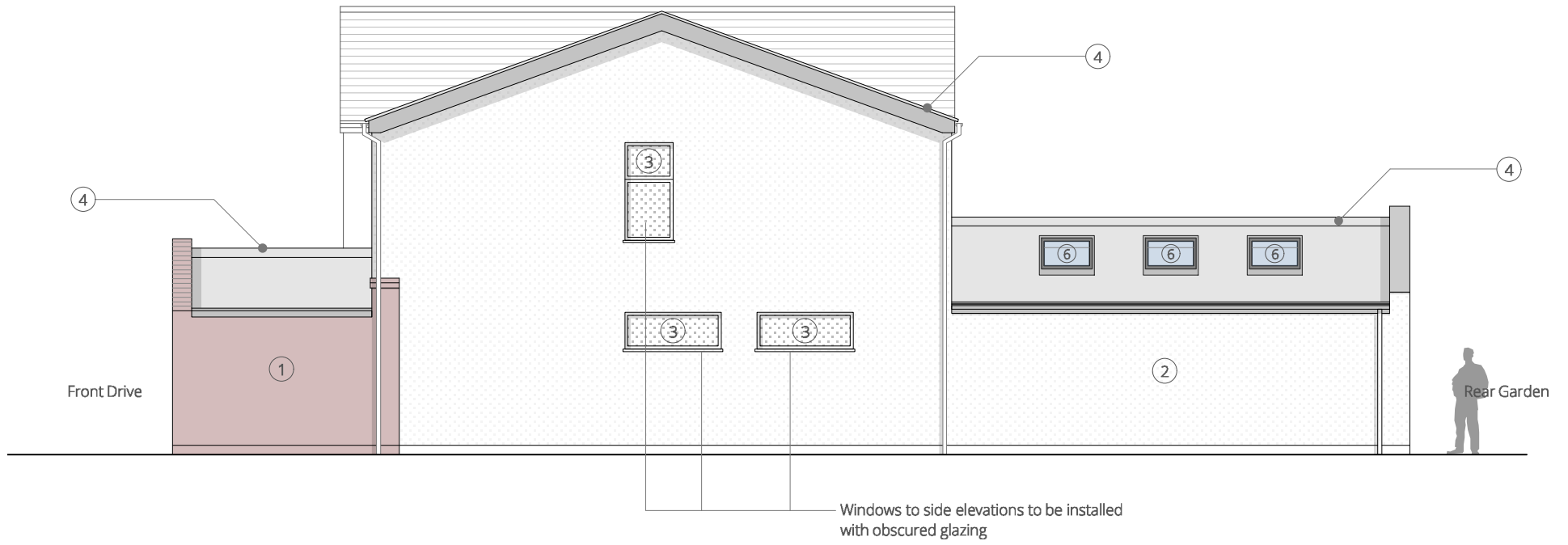
Proposed Side (SW) Elevation _ scale 1:100 @ A3