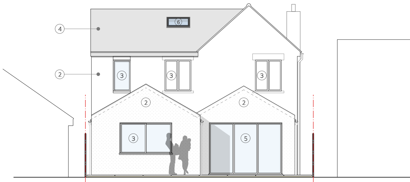
Proposed Rear (SE) Elevation _ scale 1:100 @ A3