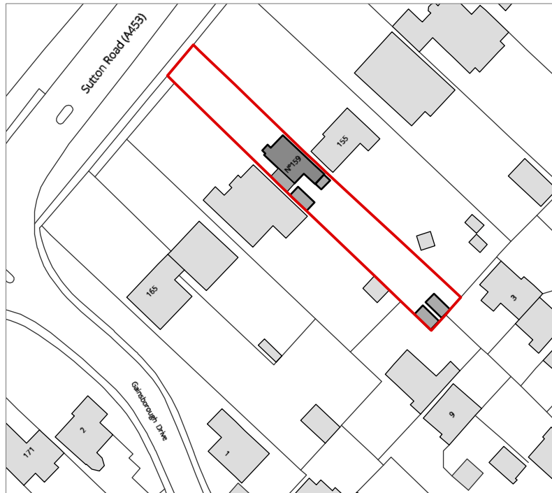
Location Plan _ scale 1:1250 @ A4