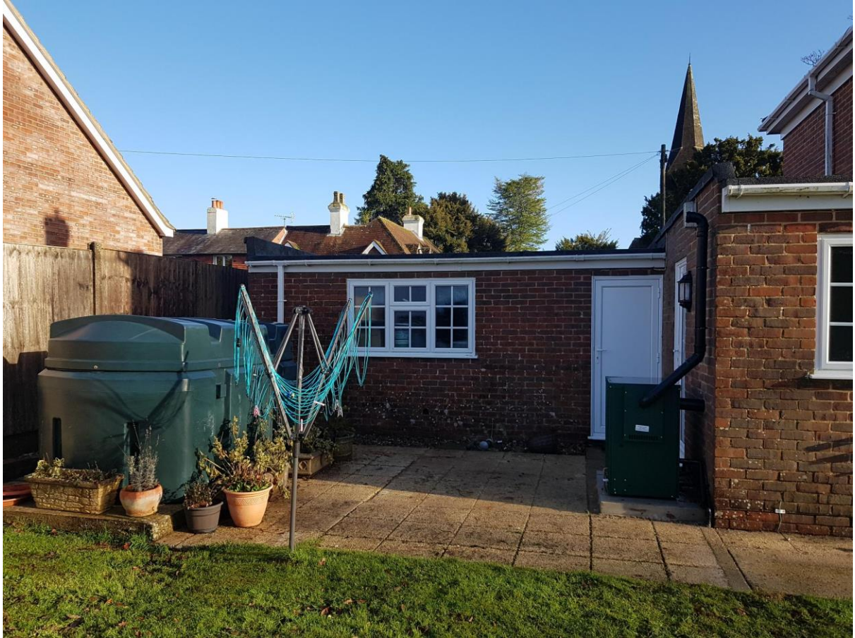
Rear Elevation of Garage