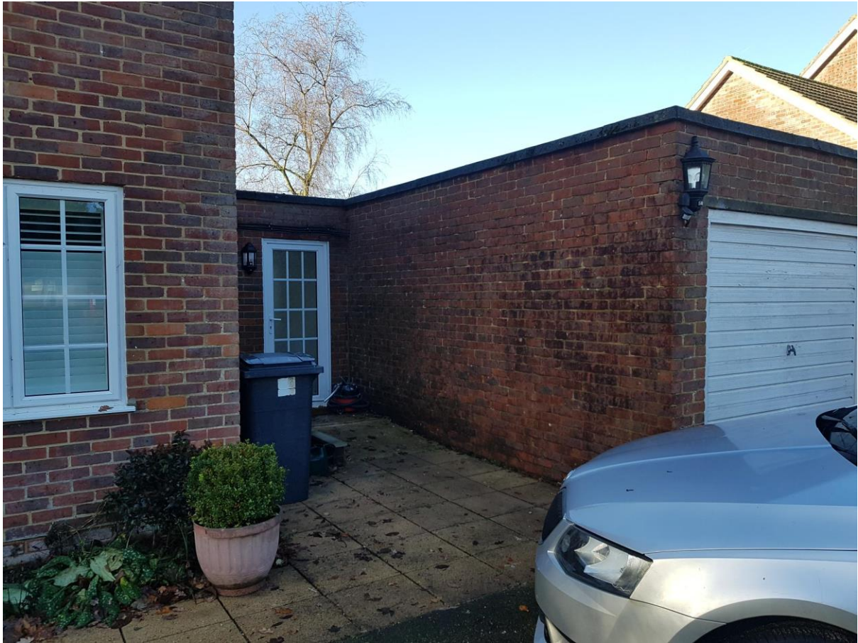
Front Elevation Approach to Utility Room