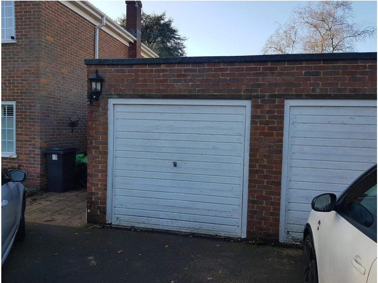
Front Elevation of Garage