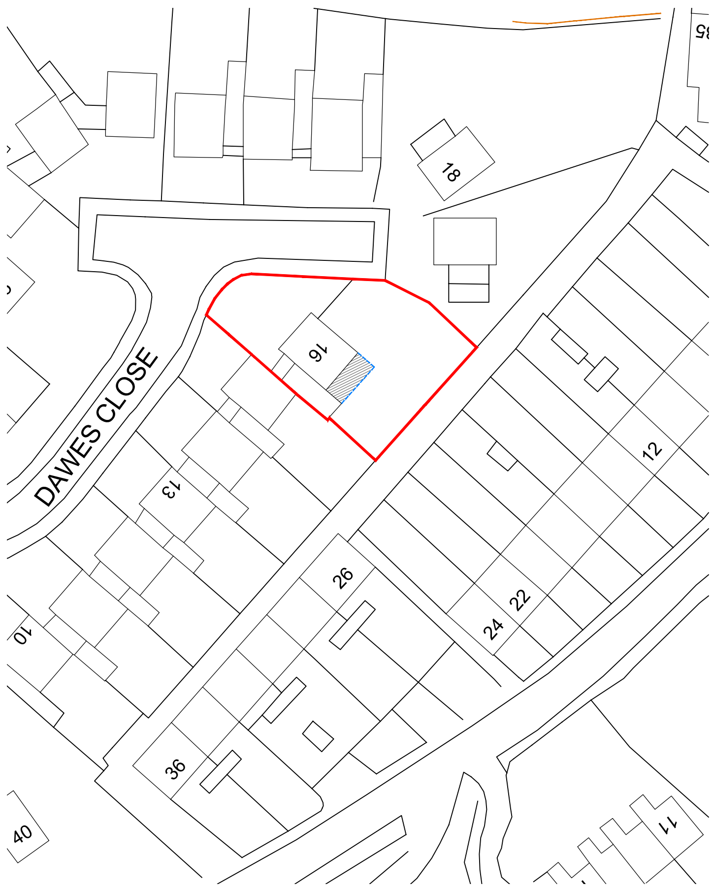
Block Plan Scale - 1:500