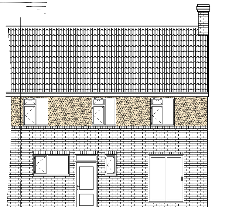
Rear Elevation as Existing.