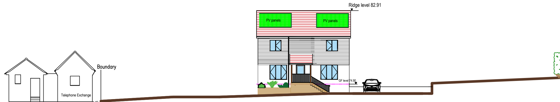
Proposed Street Scene

Residential development at 6 Hill Road, Gt Sampford CB10 2RT Alterations and extensions to existing dwelling Existing and proposed street scene Drawing No RMDS/HR/1006 Scale 1:200 @ A3