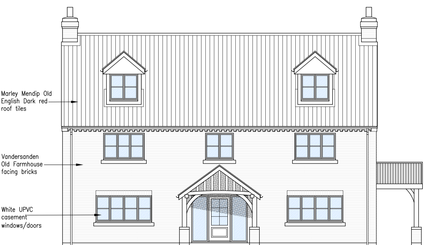
Proposed Front Elevation (Facing Drive) 1:100

The Construction (Design and Management) Regulations 2015: Peter Humphrey Associates' form of appointment with the client confirms whether the agent is appointed as 'Designer' or 'Principal Designer' under these regulations. Nevertheless, the design phase has been carried out with due consideration for the safety during construction, occupation and maintenance of the finished project. No extraordinary hazards or risks were identified outside of the routine construction operations that would not already be apparent to a competent contractor.