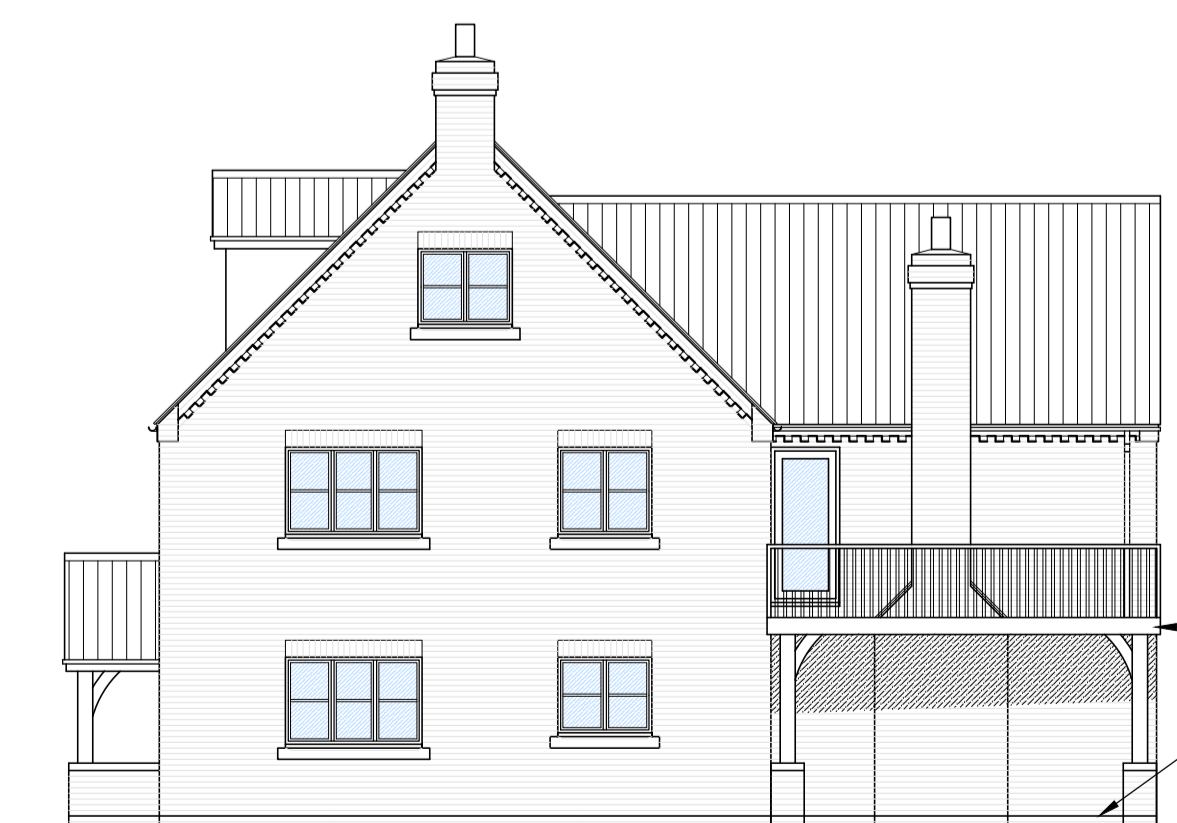
Proposed Side Elevation 1:100