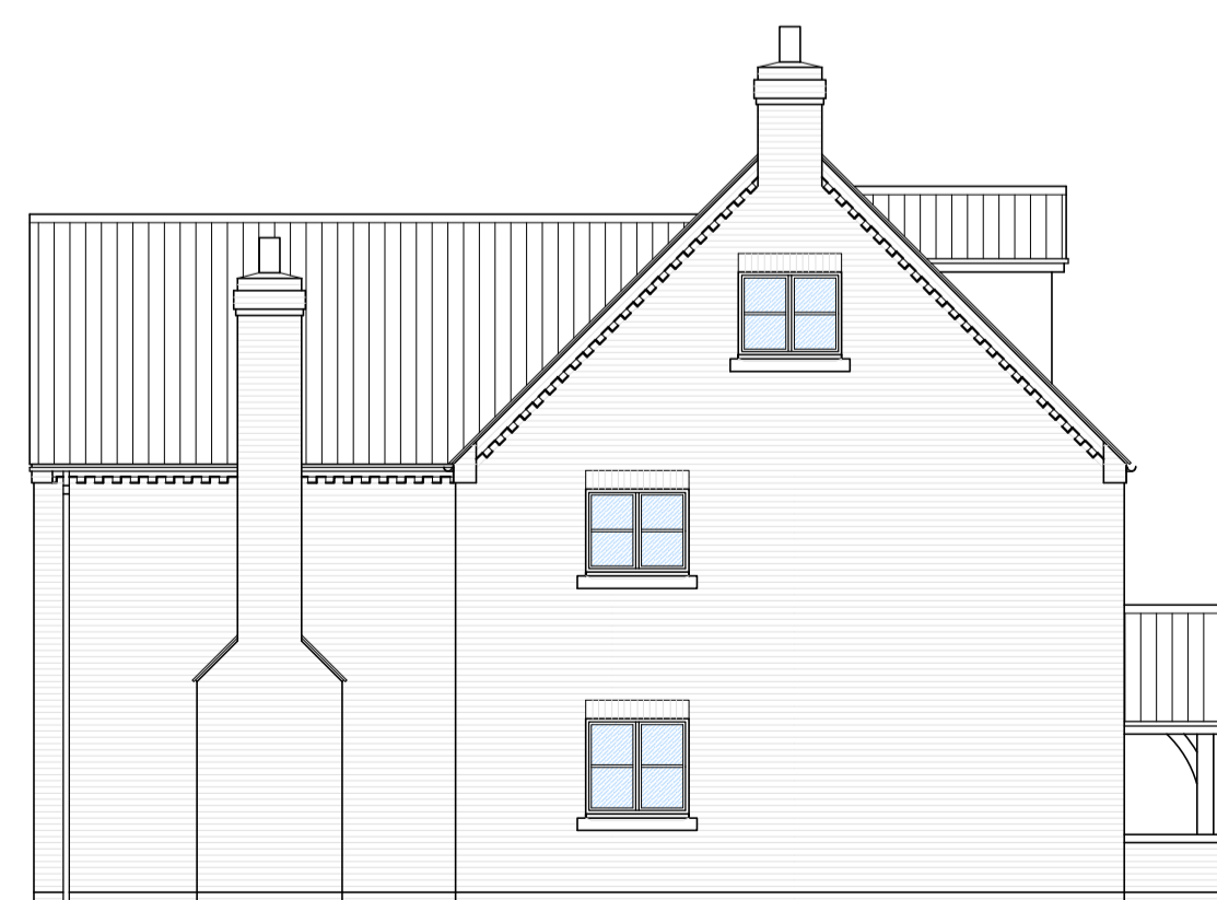
Proposed Side Elevation 1:100