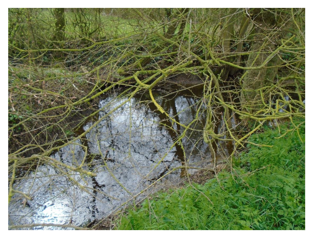
Photograph by Roger Spring 2023