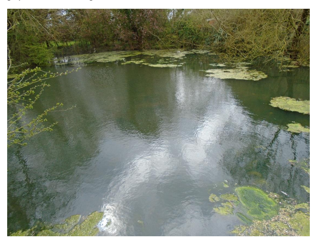
Photograph 8: Pond 2 at Bungeons Farm.