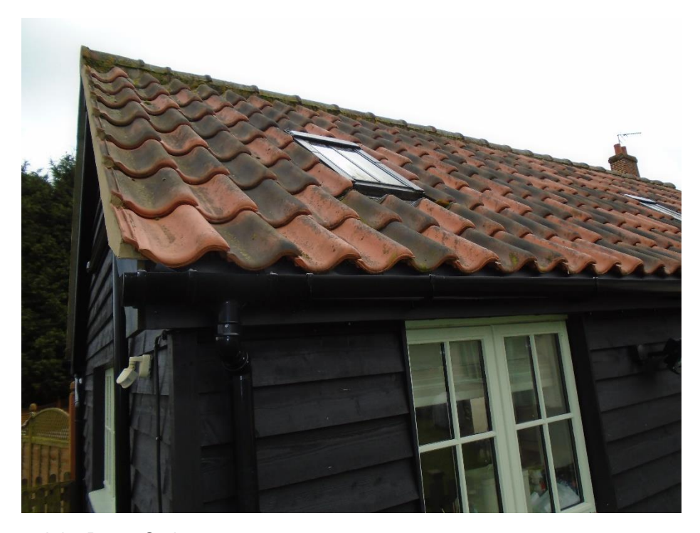
Photograph 2: Western elevation of the annex at Bungeons Farm.