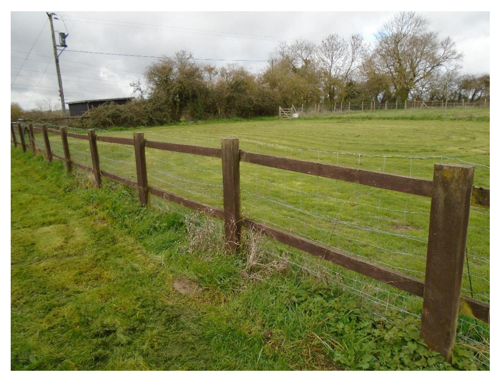
Photograph 4: Main site area looking south east to north west with hedgerow in distance at Bungeons Farm.