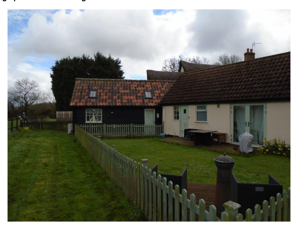
Photograph 1: Annex at Bungeons Farm.