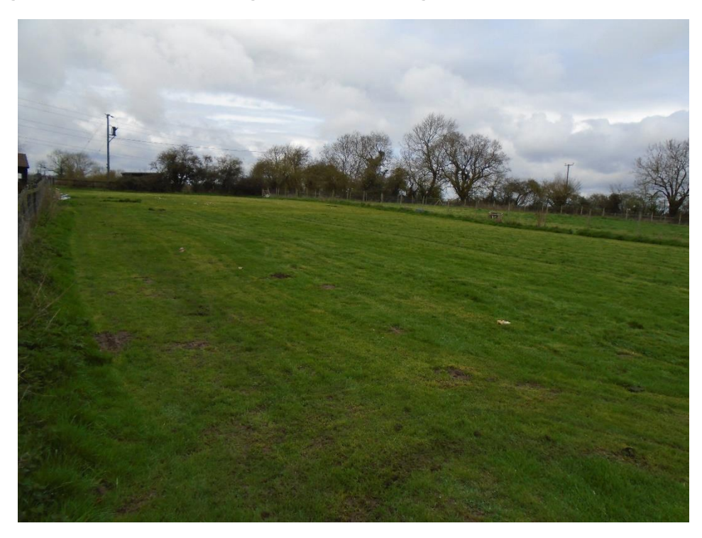
Photograph 6: Main site area looking east to west at Bungeons Farm.