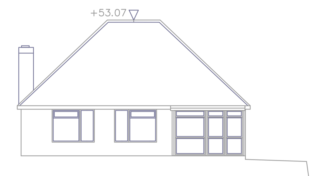
EAST ELEVATION -1:100scale @ A1