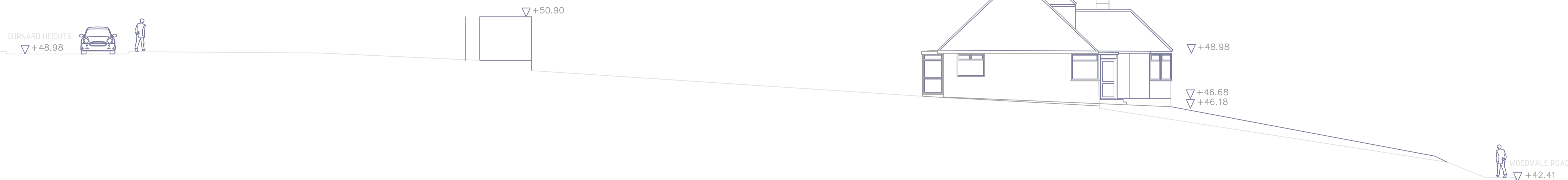
NORTH ELEVATION- SECTION LOOKING SOUTH -1:100scale @ A1