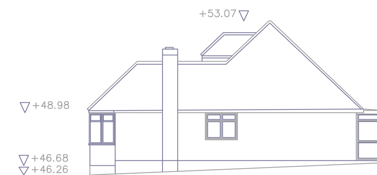
SOUTH ELEVATION -1:100scale @ A1