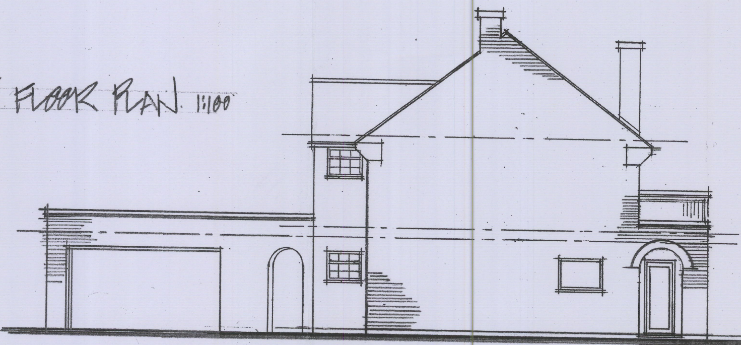
SIDE ELEVATION (WEST)