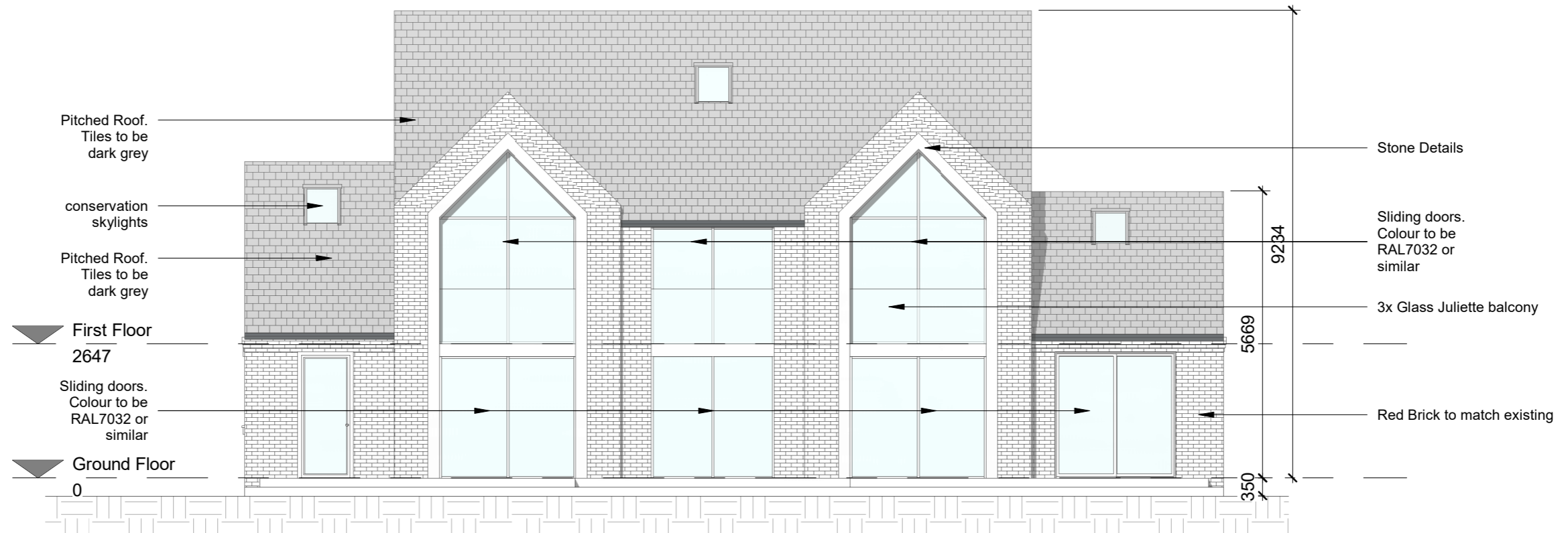
North 1 : 100