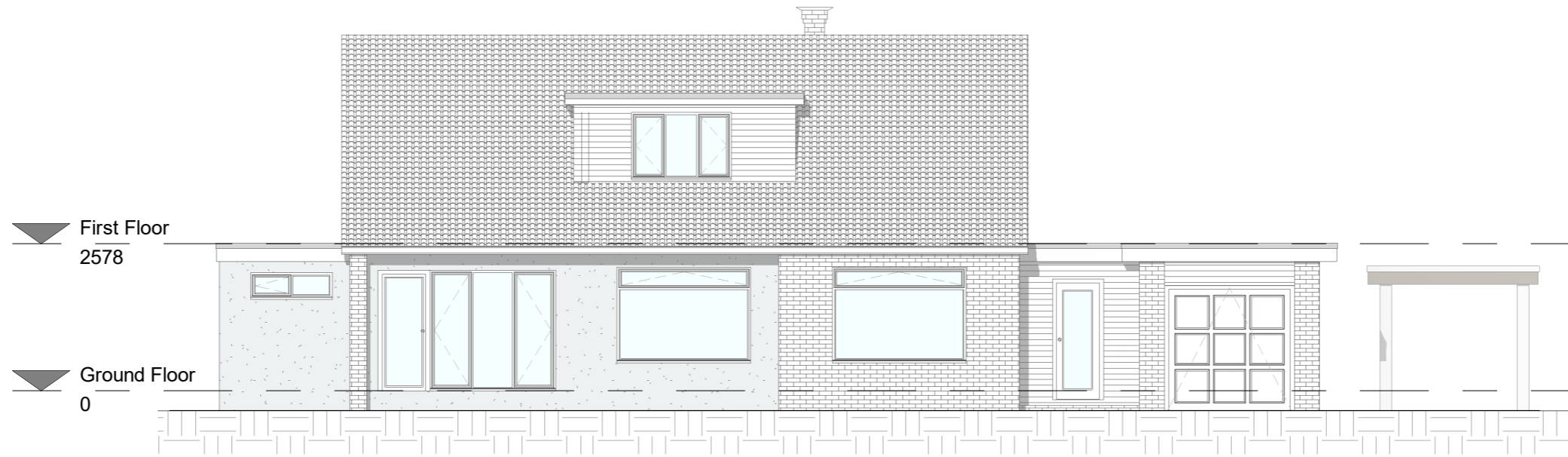
South 1 : 100

SPELGA HOUSE, STATION ROAD , FISKERTON, NG25 0UG