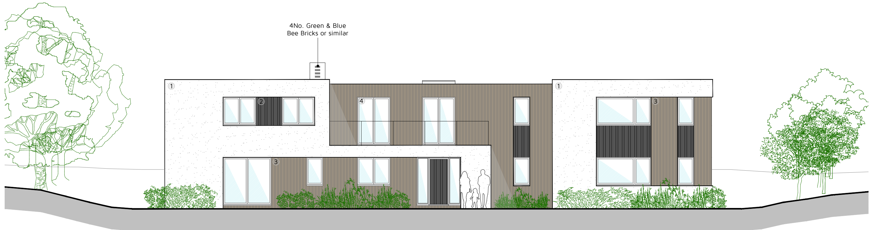
1. Proposed South Elevation 1:100 @ A3