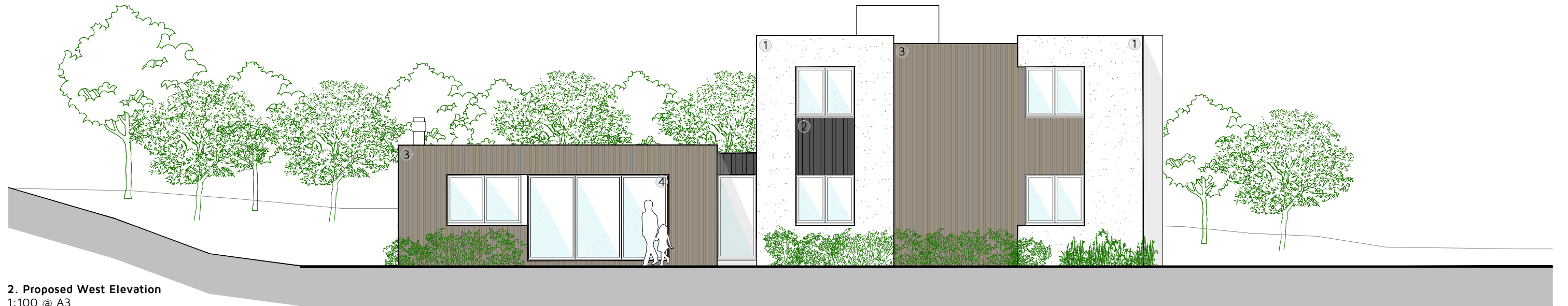
2. Proposed West Elevation 1:100 @ A3