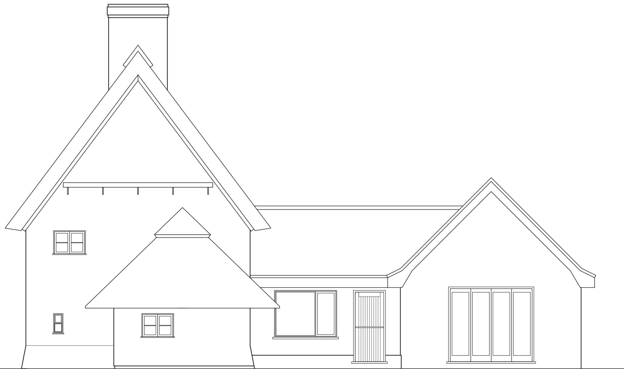
EAST ELEVATION (3)

REFER TO PHOTOGRAPHIC SCHEDULE DRAWING 1030 FOR FURTHER DETAILS