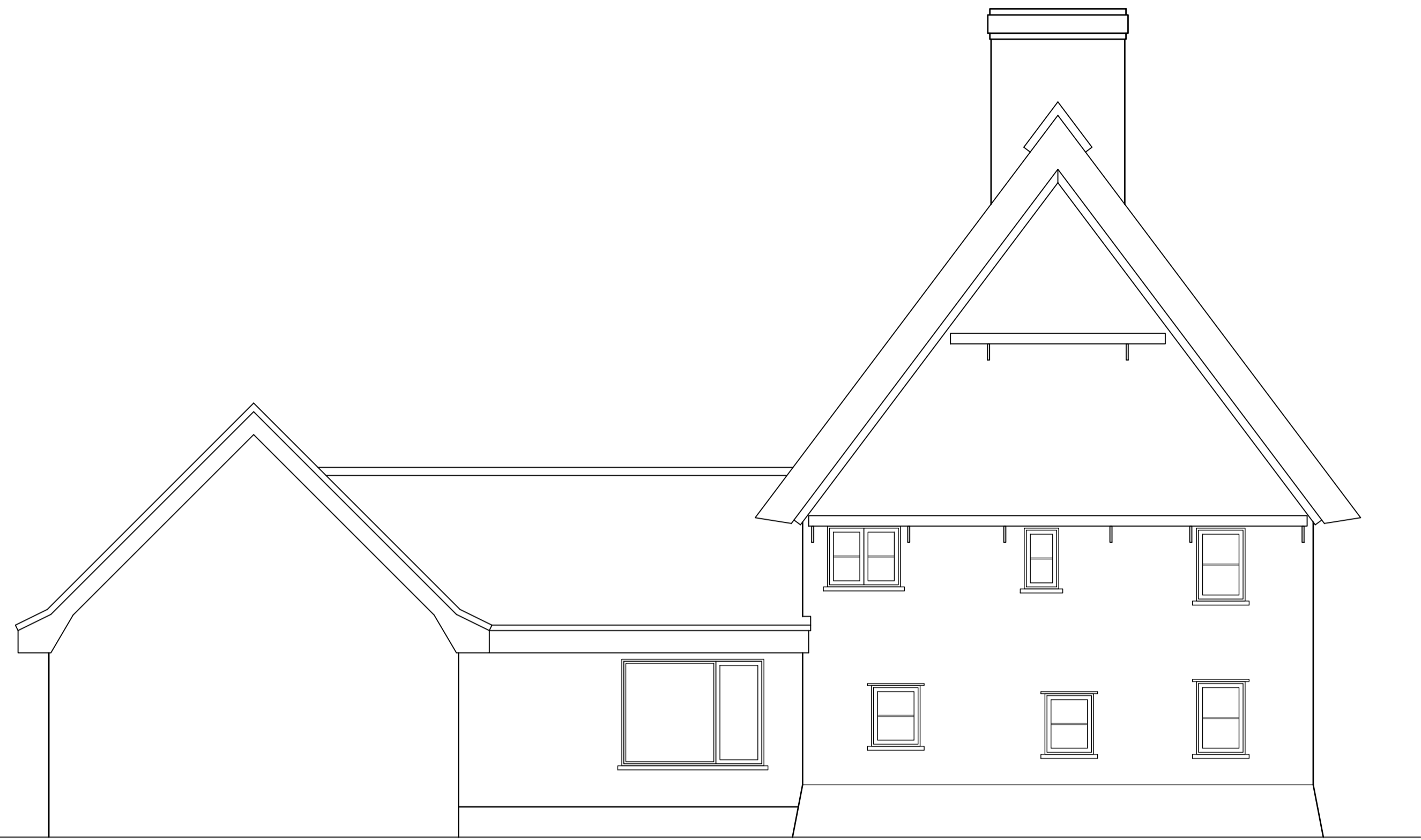
WEST ELEVATION (1)