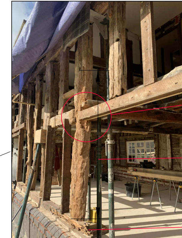
Severe decay and erosion to external face of storey post mortices for intermediate beams lost.