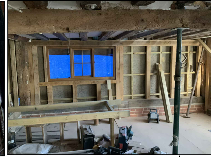
Substantial missing framing, replaced in new green oak. Softwood framing around window opening to be replaced with green oak. Missing sole plate renewed in green oak, stud tenons morticed and pegged, brickwork plinth rebuilt to matching details