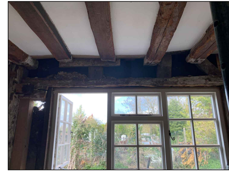
existing beam above kitchen window severely cut and reduced by existing window insertion