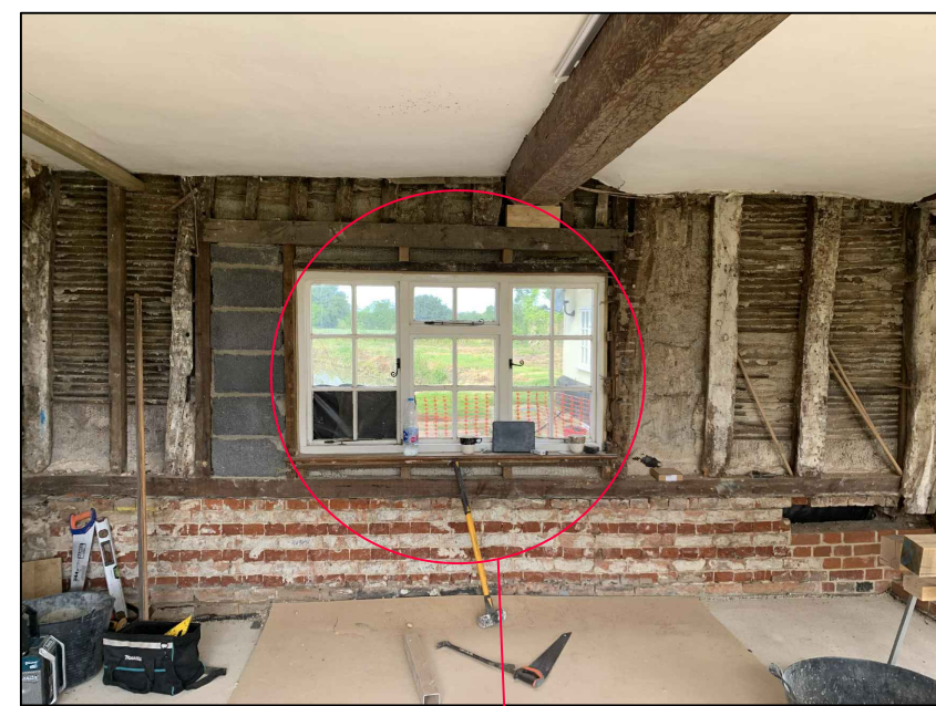
Softwood framing around window opening to be replaced with green oak designed by structural engineer to bear existing main beam. Concrete block infill to be removed as elsewhere.