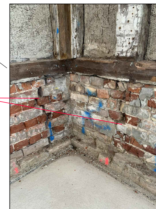
past movement fractured brickwork. Rebuild corner to re-stitch cracks using existing brickwork in lime mortar.