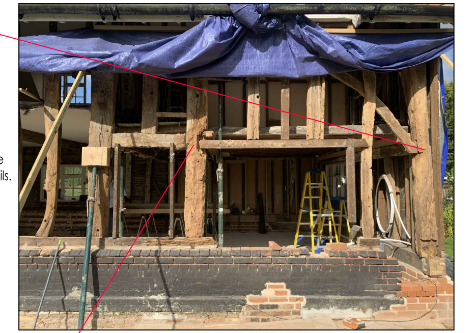
Softwood sole plate missing. New green oak sole plate and re-build brick plinth locally to match existing details.