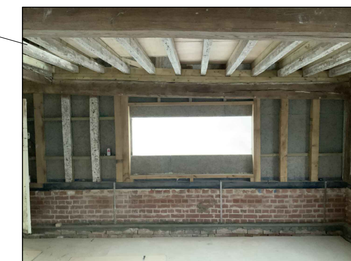
replacement green oak wall studing