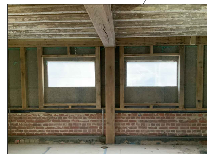
decayed softwood sole plate, renew in green oak, replacement green oak wall studing