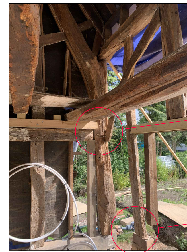
Severe decay and erosion to corner post around diagonal brace mortice. Brace loose. Face repair to cut in new green oak to remark mortice and re-secure brace.