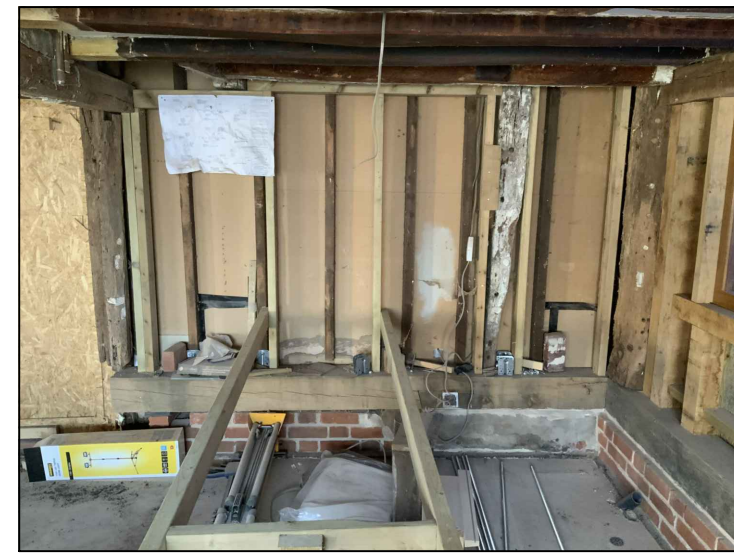
Missing sole plate renewed in green oak, supplementary softwood infill timberbrickwork plinth rebuilt to matching details