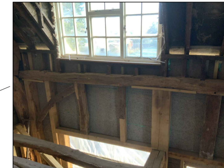
green oak repairs to wall studs