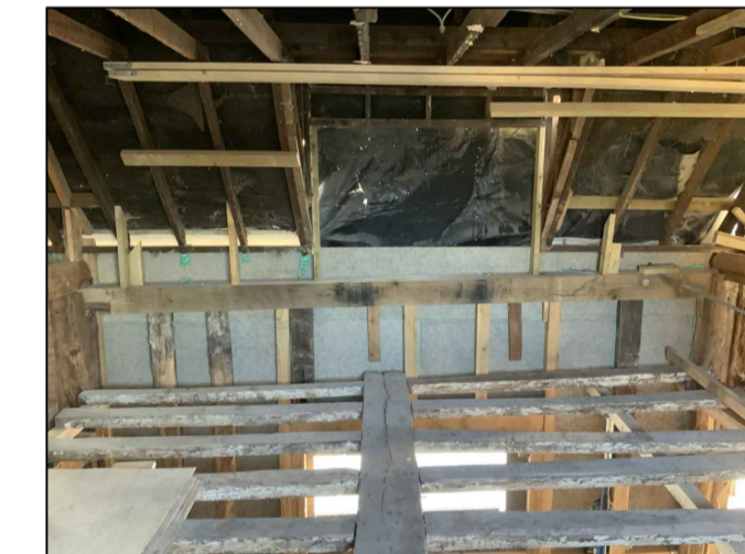
green oak wall stud replacements/repairs