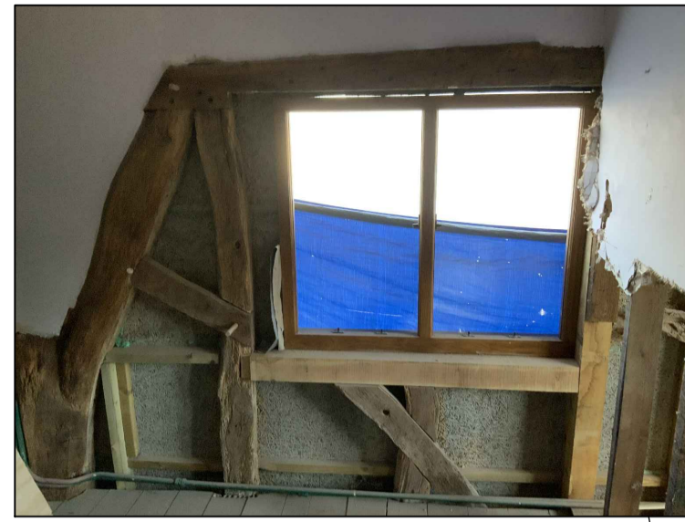
green oak repairs to window surround