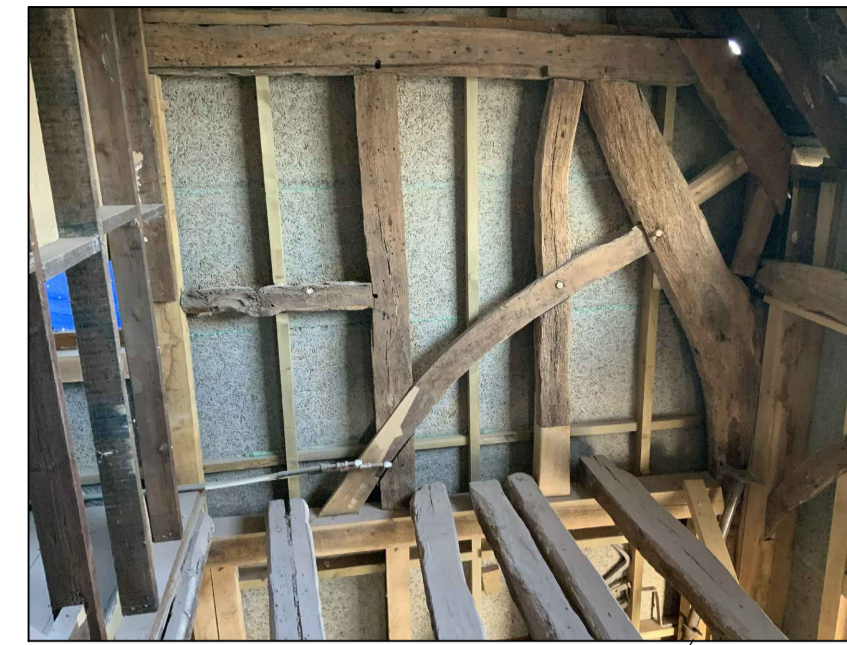
green oak repairs to base cruck, wall studs and brace