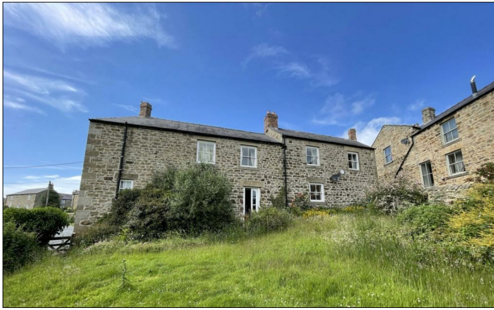
Photo 1 : Photograph of rear of original property prior garden room extension.