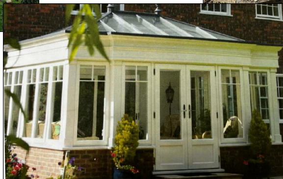
Photo 5 : Client supplied image of similar intended decorative panelling, fluted columns, and mouldings externally to garden room